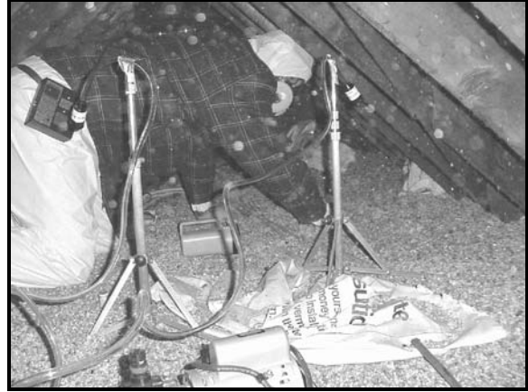
Figure 34: Dry Simulation in Attic of Vermont House - Versar employee manipulating attic insulation during simulation.

Notes: Portion of stationary ambient air monitoring pump is visible in foreground. Personal air monitoring cassettes can be seen on Versar employee, oriented toward the breathing zone.