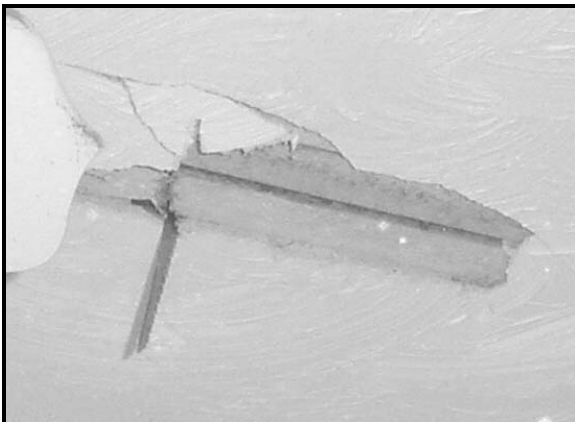
Figure 35: Hole Being Cut in Ceiling of Vermont House - View from living space, hole being cutting from attic side.

Notes: Portion of stationary ambient air monitoring pump is visible in foreground. SKC low volume air pump visible on belt of Versar employee.