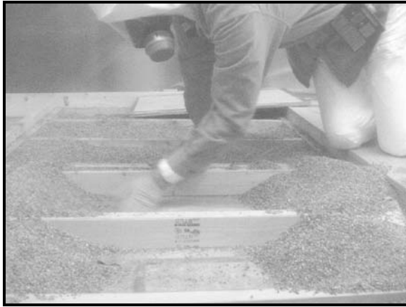
Figure 29: Vermiculite Being Cleared in Artificial Attic Space of Main Containment - Simulation of digging a trench to install electrical wiring.