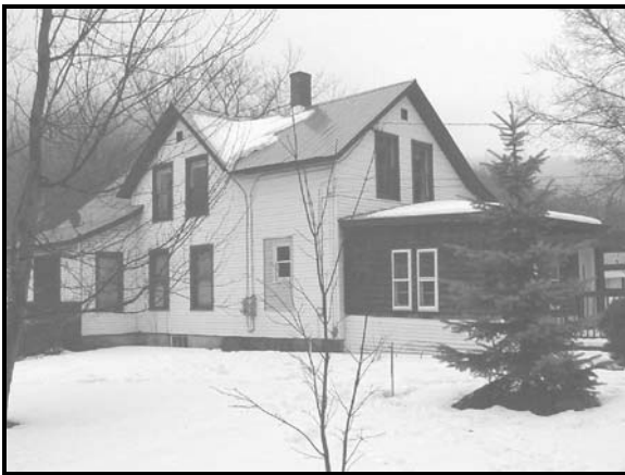
Figure 31: General View of Exterior of House in Bethel, Vermont