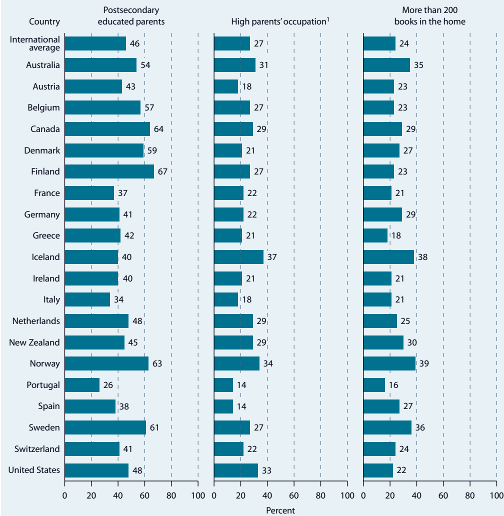
Figure 1. Percentage of 15-year-olds whose parents had a postsecondary education, had high occupational status, and had more than 200 books in the home, by country: 2003