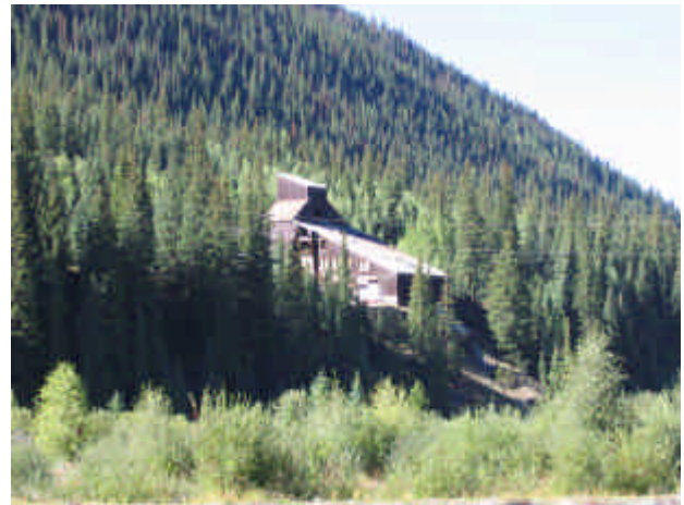
Animas River Corridor, Colorado

At the Copper Basin site in Tennessee, multiple activities were being conducted in the area by federal and state programs. With multiple projects occurring simultaneously in the community, citizens were confused about what questions each different agency could answer. EPA Superfund staff collaborated with EPA Resource Conservation and Recovery Act (RCRA), Air, and Water offices, the Forest Service, and the state Superfund program to set up a joint meeting with representatives from all the groups. This crossover meeting was beneficial in that the public received answers to all of its questions in one single setting, and the agencies gained a better understanding of each program's role in the area.