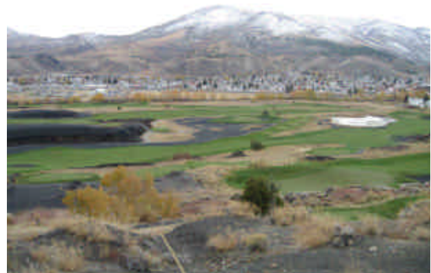
Anaconda Co. Smelter, Montana

Often at AML sites, EPA's mission is to clean up or remove the very pieces of the landscape that give mining towns their character and define their mining heritage. Life-long residents of these communities become attached to the symbols of mining left in the town, such as mine waste piles and other mining artifacts. When a town is defined by a mine, EPA must recognize this connection and work to maintain the integrity of the town's mining history. Community involvement activities may need to focus on ways to involve the community in decisions potentially impacting symbols of the town's history and identity.