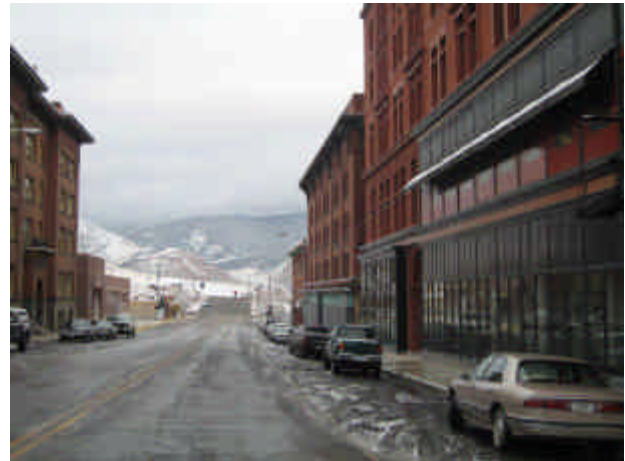
Silver Bow Creek/Butte Area, Montana

At AML sites, mining activities are often the backbone of a community's economy. Mining communities tend to be cautious when EPA commences cleanup activities as they fear losing current jobs and future mining opportunities. Many of the communities included in this report were still economically tied to the mining industry and continued to show loyalty toward these companies.