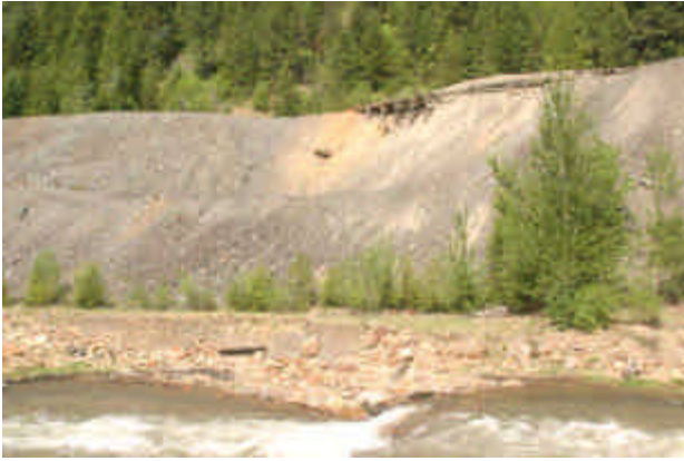
Bunker Hill Mining & Metallurgical Complex, Idaho

Similarly, EPA staff from Central City, Clear Creek indicated that the community in Idaho Springs responded positively to publicized accomplishments at the site. EPA noted that it took the community a long time to trust EPA and its intentions. Once removal actions and other visible cleanup work started at the site, there was a noticeable increase in the level of public participation and trust of EPA staff. Community members want to see that EPA is not only present at the site, but actively working to protect human health and the environment.