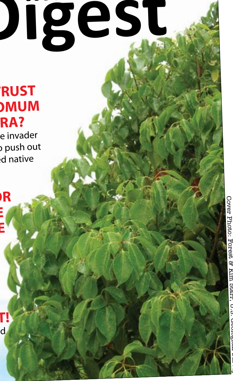
Cover Photo: Forest