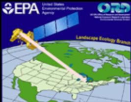
For more information about the Landscape Ecology Branch and projects in the Great Lakes, visit us at our web site: http://www.epa.gov/nerlesd1/land-sci/wetlands.htm