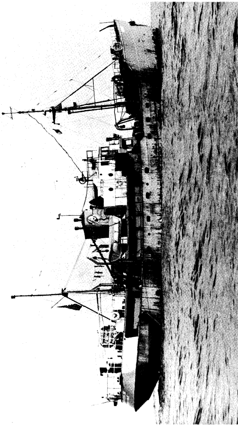
Figure 40.--Research vessel Albatross III assigned to the Woods Hole Station in 1948 .