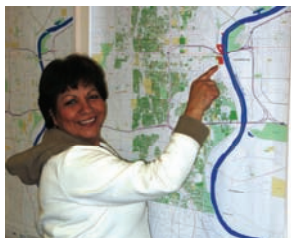
EPA Public Information Center, South Location