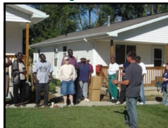
UNL - Extension - Douglas and Sarpy Counties