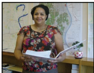
EPA Public Information Center, North location