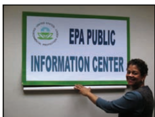
EPA Public Information

EPA and ATSDR are working with local groups to get lead information to you.