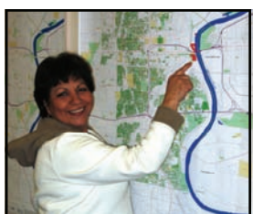
EPA Public Information Center, South Location