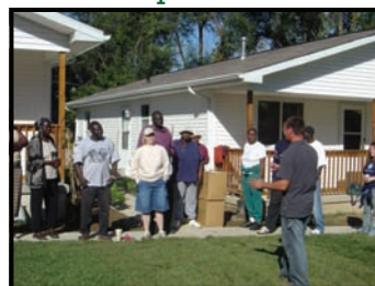
UNL - Extension - Douglas and Sarpy Counties