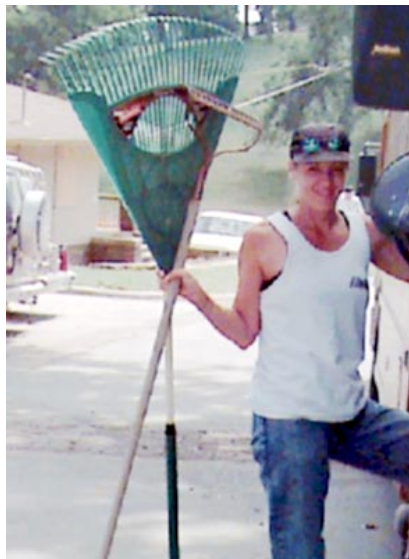
Omaha Clean-Up Participant