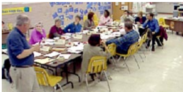
St. Louis Listening Tour

❑ Assess, protect and restore the quality of the air, water, land, and living resources. CBEP is a multimedia approach that brings together EPA programs and helps create natural resource planning and action.