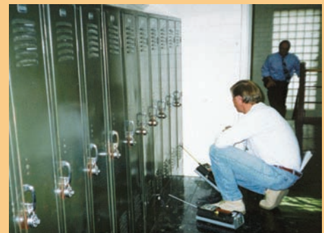
EPA testing air in a school following a mercury spill

If there is a spill the area should be evacuated quickly and cleaned up properly.