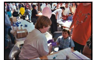
Douglas County Health Department