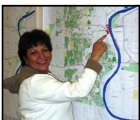
EPA Public Information Center, South Location