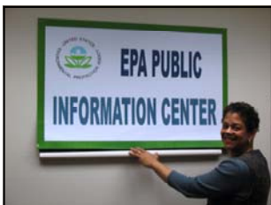
EPA Public Information Center, North location