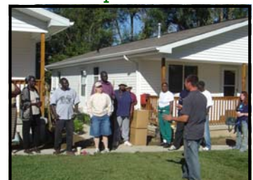
UNL - Extension - Douglas and Sarpy Counties