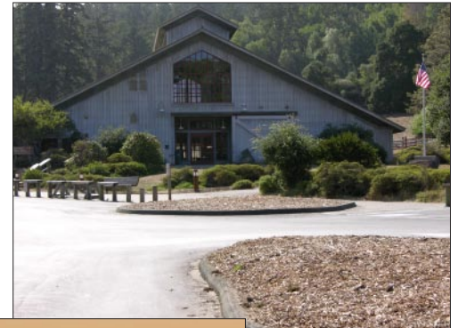
Bear Valley Visitor Center (above) and Limantour Beach

Point Reyes National Seashore is a Climate Friendly Park due to the efforts of reducing waste, implementing sustainable practices and reducing GHG emissions. The park has an