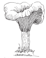
The mushrooms growing with young bishop pines are different than the mushrooms growing with older bishop pines...

Research done after the fire made an important discovery about succession in the bishop pine forest. The forest's mushrooms had changed! The thread-like fungus on the roots of the seedlings was a different species than on the mature trees. Their spore-containing fruits, the mushrooms seen above ground, were different too. Species of root fungus (mycorrhizae) are important to many plants, and almost all trees. They are like an extra set of roots, which absorb water and nutrients in exchange for sugars made by the plant through photosynthesis, a process fungi can not do. Countless spores had been dormant in the soil, waiting for a fire too. It was evident that root fungus played a major role in seedling survival and likely in their competition as well.