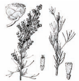
California sagebrush Artemisia californica

Coyote brush is much more common than California sagebrush in Central California. As you walk down the trail, notice its size and shape. All of this scrub is post-fire regrowth. As coastal scrub matures, it changes considerably. Coyote brush can reach heights up to ten feet. As it grows, it sheds its lower limbs, so the understory opens up. This structural change significantly alters the way the vegetation is used by other creatures as habitat. This was dramatically illustrated at Point Reyes after the Vision Fire by the fate of the mountain beaver, a small, burrowing rodent endemic to the area.