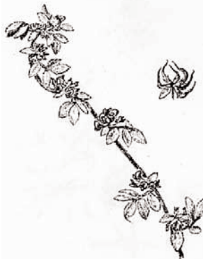
Hairy-leaved lotus Lotus eriophorus

Nitrogen, however, is scarce after a fire. Many legumes, members of the pea family, are important early nitrogen fixers that move in after