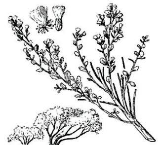
Growing in this open-

Up ahead, on the right, the crowded pines you have been walking next to, change all of a sudden. What makes the forest stop, and become replaced by scrub? Maybe no bishop pine seeds fell in this spot, or those that did were disturbed before they could sprout. Maybe there was too much nutrient-rich ash here, or maybe it all washed away. Were there seed predators? Did the fire just miss an area altogether? Maybe variation in soil chemistry favored scrub species over pines.