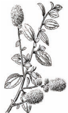
Blue blossom ceanothus Ceanothus thysiflorus

Here, you enter the wilderness through an archway of ceanothus. Ceanothus flourished after the fire following waves of lotus and lupine. All three of these plants have a life sustaining role, central to the vibrant regeneration taking place in the burn area. They all have nitrogen-fixing bacteria living in their roots.