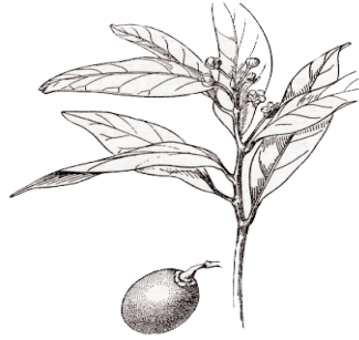
California bay laurel Umbellularia californica

damage caused by a fire actually stimulates tissues in the base of the tree to produce vigorous new shoots. The effect is similar to that caused by pruning. Basal sprouting is often associated with a thick tuber (underground root) or burl (massive stem base) which store food so plenty of energy is available when resprouting is triggered.