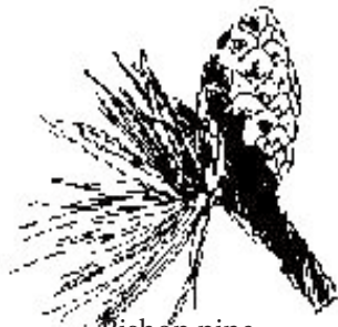
Bishop pine Pinus muricata

At the beginning of the trail, notice the trees around you. These are bishop pines. This dense, young forest is a clue that a major fire recently burned here. Bishop pine uses fire to regenerate itself. Look for cones on the trees. Bishop pine seeds are protected in tightly-closed, or “serotinous” cones, which open when exposed to heat. This can happen on a very hot day, but usually only fire can break the resinous seal.