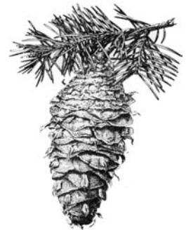
Douglas fir Pseudotsuga menziesii

The tree in front of you probably endured many fires before it was killed in 1995. Notice, however, that its scorched bark is well intact. This tree was not killed by flames penetrating its outer skin. Instead, the fire reached the top of the tree, more than 150 feet above the ground, and burned its foliage and unprotected upper branches.