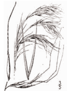
Purple needle grass Nasella pulchra

Perennial grassland once covered much of California. Suppression of fire since Euro-American settlement is one reason for its decline. Prior to the nineteenth-century, fire occurred much more frequently, many of them set by Native Americans as a tool for managing the landscape. Regular burning favored perennial grassland over scrub. Native Americans harvested seeds from these grasslands and hunted grazing animals like deer and elk. In the absence of fire, shrubs like coyote brush colonize grasslands, and convert them to scrub.