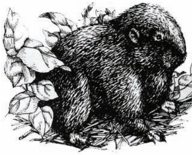
Mountain beaver Aplodontia rufa

mer, but also a relatively open understory to allow freedom of movement. Although the dense, post-fire regrowth provided excellent habitat for some species, like the small brush rabbit, it was disastrous for the mountain beaver, whose population plummeted from an estimated 5000 to only 19 in the burn area.