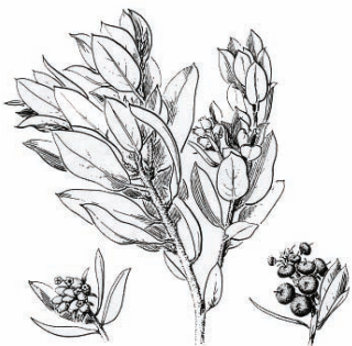
Marin manzanita Arctostaphylos virgata

Bishop pine is highly flammable, and rarely survives a fire. When a fire burns a mature stand, the existing trees are killed, but the seeds released from their cones sprout quickly on the freshly exposed soil. The result is an even-aged forest, like this one, where a new generation has entirely replaced an older one.