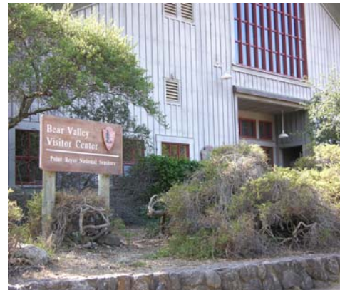
Bear Valley Visitor Center

State and local tax impacts differ between the two counties model and the state model, as the state model includes impacts from economic activities that occur within the State but outside of the two counties. Just as the economic impacts tend to be higher for the State than the two counties, the tax impacts will also be higher for the state model than the two counties model. Table 14 below shows IMPLAN's estimated tax impacts to the two counties and the State.