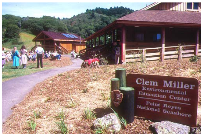
Clem Miller Environmental Education Center

Employment generated by Park operations is estimated by the IMPLAN model to be 190 within Marin and Sonoma counties and 210 in California. Note that the employment reported in Table 2 is derived by IMPLAN from Park budget and concessioner receipts information for direct, indirect and induced economic activity. Actual employment at PRNS differs; as of 2005 the PRNS itself reported 115 full-time equivalents.