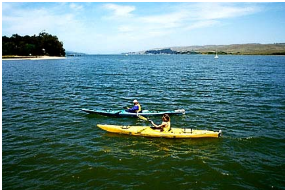
Kayaking on Tomales Bay

Sources: IMPLAN, 2006; Bay Area Economics, 2006.