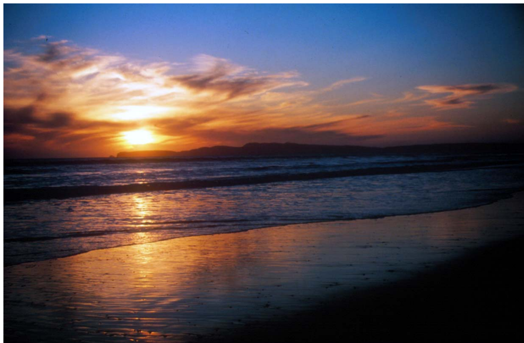
Sunset looking towards the Headlands