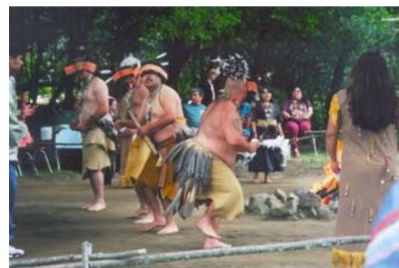
Traditional Coast Miwok dancers

Numerous culturally significant sites are located within the Park. Point Reyes has over 100 known village sites of the Coast Miwok Indians, the first human inhabitants of the peninsula. Other cultural