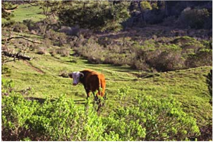
Bull in grazing pasture

According to PRNS staff, there are currently 2,562 animal units (AUs) dedicated to beef production and 3,451 AUs dedicated to dairy production located on 25,000 acres of Park land. Of this total, approximately 90 AUs are dedicated to organic beef production. The Minnesota Department of Agriculture provided conversion factors that estimate that a mature dairy cow equals 1.2 AU, a slaughter steer or stock cow equals 1.0 AU, a heifer equals 0.7 AU, and a calf equals 0.2 AU.