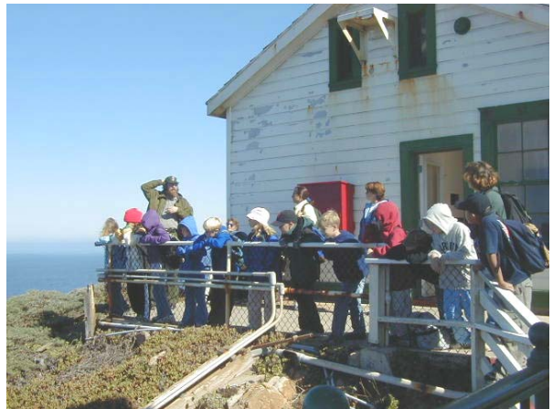
Interpretive ranger at Point Reyes Lighthouse

PRNS is home to several research and educational facilities that support coastal stewardship through science. The Pacific Coast Learning Center leverages research and science from partner agencies, universities and other organizations to reduce the research backlog at the park. The newly created Marin Science Center has research and classroom facilities at Sacramento Landing on the water. The Sabbatical in the Parks program assists in arranging university faculty sabbaticals to