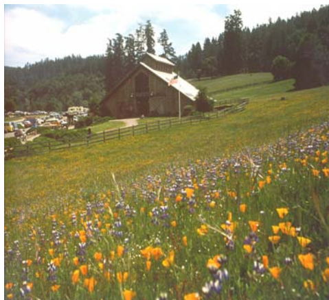
Bear Valley Visitors Center

Employment Generated. Visitor spending generates a significant number of jobs, 540 within Marin and Sonoma counties and an additional 110 jobs in California.