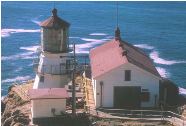
Point Reyes Lighthouse

Established in 1962, Point Reyes National Seashore is one of the nation's coastal treasures. With over 71,000 acres, including 33,000 wilderness acres, the Park encompasses estuaries, beaches, grasslands, salt marshes, and coniferous forests, creating an 80 mile haven of unspoiled and undeveloped coastline in California (See Figure 1). The Park serves as an important link in a chain of protected areas, sharing boundaries with the Gulf of the Farallones and Cordell Bank National Marine Sanctuaries, Tomales Bay State Park, and Golden Gate National Recreation Area (it should be noted that the PRNS manages an additional 20,000 acres of lands within the Golden Gate National Recreation Area). Over 45 percent of North American avian species and 18 percent of California plant species can be found within the Park. Point Reyes is internationally recognized by the United Nations Educational, Scientific, and Cultural Organization (UNESCO) as part of the Central California Coast Biosphere Reserve.