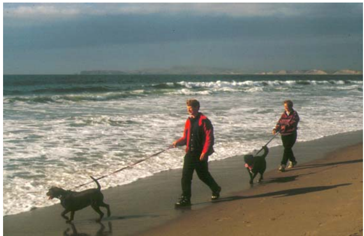
Dogs on leash along Limantour Beach

The 1997 visitor survey estimates the average daily expenditures on food, gas, lodging, gifts, and other retail expenditures within a 60-mile radius of the Park. These daily expenditures are made on a per “visitor-party” basis. 3 The analysis further differentiates visitors by type of visitor (i.e. day tripper, visitors staying in motels, and campers), as each type of visitor has a unique spending pattern. These spending patterns are the basis for estimating the economic impacts of visitor expenditures and they are shown in Table 3 below.