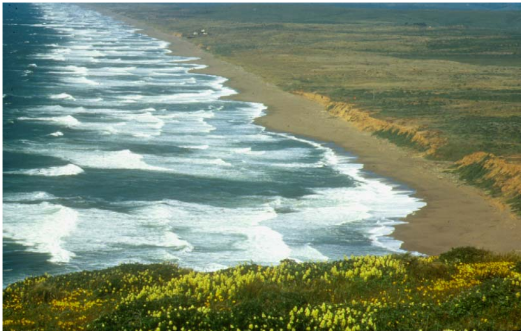
The Great Beach at Point Reyes

By reviewing both the quantitative and the qualitative analyses provided herein, policy-makers and the general public will have a comprehensive understanding of the Park's economic contributions and its importance in the local economy.