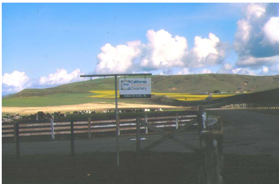
McClure Dairy Ranch

Sources: IMPLAN, 2006; Bay Area Economics, 2006.