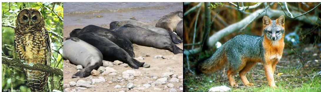
Northern spotted owl, elephant seals, and gray fox

Point Reyes National Seashore is a unit of the National Parks system managed by the National Park Service, U.S. Department of the Interior. Park management of its programs and operations is accomplished by several divisions: Administrative, Interpretation and Resource Education, Natural Resources Management, Resource Protection, Cultural Resources Management, Facilities Management, Science, and Fire. Point Reyes had 147 employees and a total budget of $14.3 million in fiscal year 2005.