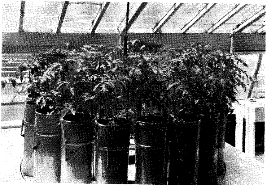
FIG. 3. Sand cultures mounted on a rotating table in unevenly lighted greenhouse.