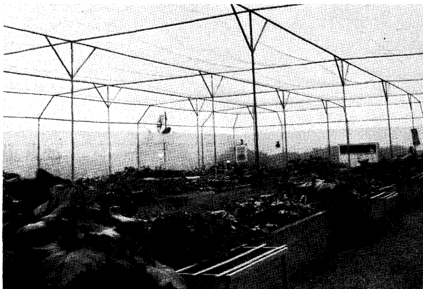
FIG. 4. Out-of-doors sand cultures for annual crops.

The new sand cultures for annual crops grown to maturity, figure 4, have dimensions similar to the one previously described (3, fig. 2) except that the