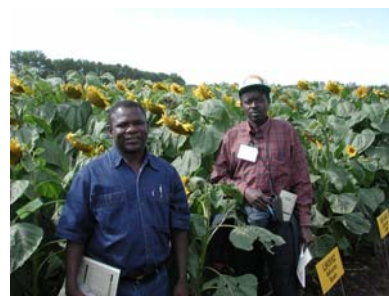
Participants from Uganda inspect the sunflower hybrid trials at the Carrington Research and Extension Center.