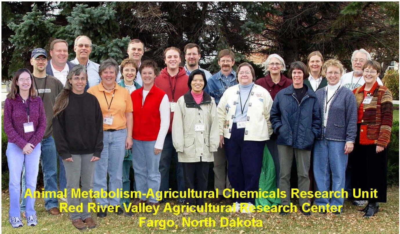
Animal Metabolism-Agricultural Chemicals Research Unit Red River Valley Agricultural Research Center Fargo, North Dakota