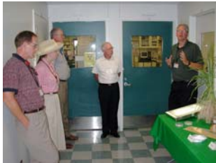
Cereal Crops Research Unit