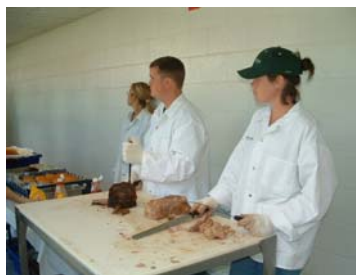
NDSU Carnivore Catering catered the Bar-B-Q lunch at the NCSL.