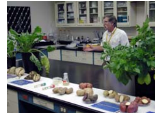
Sugarbeet & Potato Research Unit