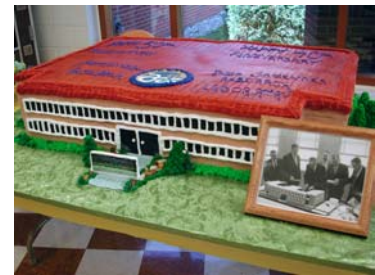
The anniversary cake was a reproduction of the original cake served at the dedication of the Metabolism & Radiation Research Lab (since renamed Biosciences Research Laboratory) in 1964.