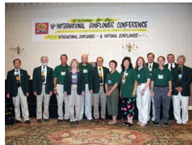
The Sunflower Research Unit was host to the 16th International Sunflower Conference in Fargo.