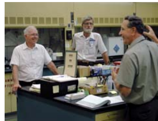
NDSU - Electron Microscope Lab