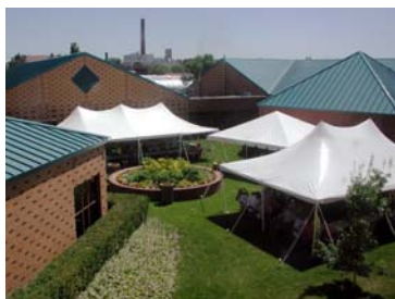
Lunch was served under tents at the NCSL.