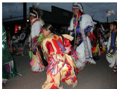
Native American dancers from Sisseton entertained the participants at Bonanzaville.