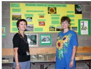
Sunflower Research Unit