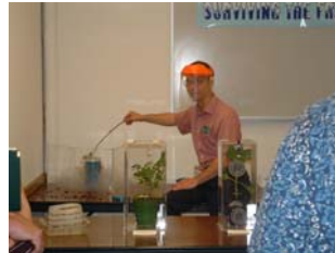
Insect Genetics & Biochemistry Research Unit