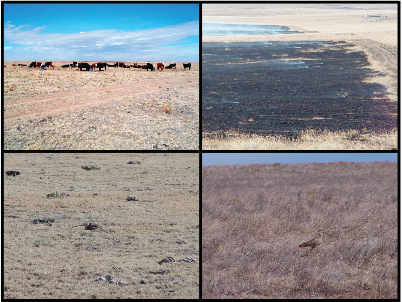
Figure 2. Example of within-pasture scale heterogeneity management through modifying livestock behavior by (upper left) strategic placement of supplemental feed (photo credit: Mary Ashby); (upper right) example of within-pasture scale heterogeneity management through patch burning in shortgrass steppe (photo credit: Mary Ashby); and (bottom left) examples of nesting habitat (photo credit: David Augustine) of long-billed curlew with low vegetation structure and prevalence of bovid fecal piles for concealment, and (bottom right) foraging habitat (photo credit: Cedric Selby) in midheight grassland.

(area furthest from water) can result (e.g., Adler and Hall 2005), commonly called the piosphere effect (Lange 1969), and provide a suite of needed habitats for this species. At the among-pasture scale, varying intensities and/or seasons of use, including deferment and/or rest might be sufficient to create differences in vegetation structure between pastures, thereby increasing edge effects.