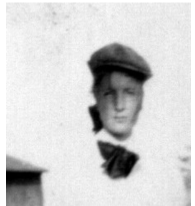
Mary Jane Truman