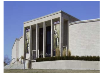
Truman Presidential Library and Museum