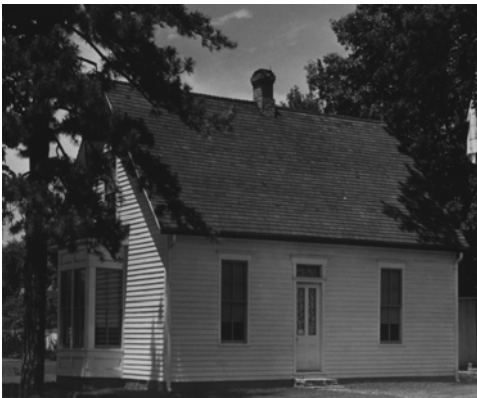
Truman Birth Home in Lamar, MO