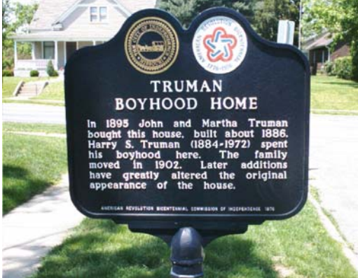
Truman Boyhood Home Corner of Waldo and River. Independence, MO

Harry S Truman grew up in Independence, Missouri.