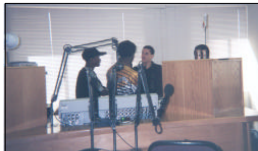
Soweto Community Radio

to inform listeners about critical issues, to give listeners the opportunity to speak out, and to promote local music. Fifty percent of broadcast time is devoted to issues involving women and youth. During local and national elections, Soweto Community Radio invited all candidates to participate in a live two-hour program. After the elections, the station invited Ward Councillors to participate with listeners in an on-the-air discussion of neighborhood concerns.