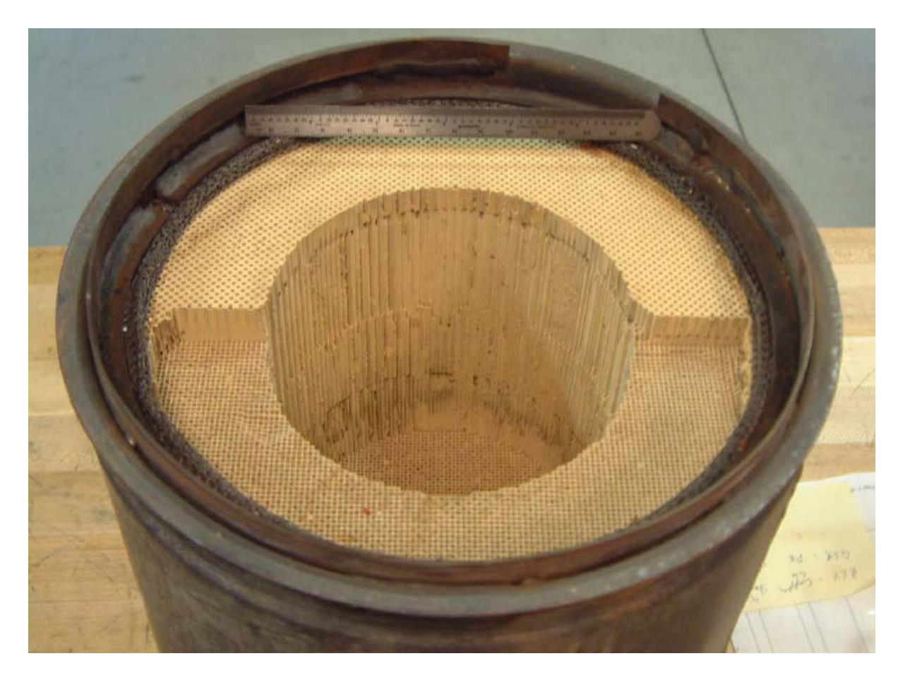
Figure 5. Rear Face of DPF Modified to Simulate Missing Substrate Due to Melting During Un-Controlled Regeneration

detectable dP change from the dP observed at each mode in the baseline test, an observed dP value at which a malfunction can be detected is established. As the test data show, for the particular DPF failure that was simulated, a malfunction could be detected if the engine were operated at or above the "B75" engine speed and load conditions. At test conditions where the malfunction would have been detected (i.e. B75, B100, C75, and C100), the post-DPF PM levels were 1.8-to-3.1 times the 0.01 g/bhp•hr PM emission standard (i.e., below our threshold of the PM standard + 0.04). For DPF failures which result in a larger change in the dP signal (e.g. more of the DPF volume is missing and/or more channels are open), the engine speeds and loads at which a malfunction can be detected become lower as well.