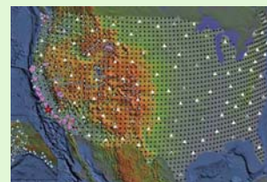
Map depicting EarthScope instrument array.

These components of the nation's research infrastructure are as varied as a gravity-wave observatory, multiple laboratories for materials research, a center for optical science used to improve Lasik surgery and the EarthScope facility. This continental-scale array of geophysical instruments enables study and prediction of tremor activity in North America.