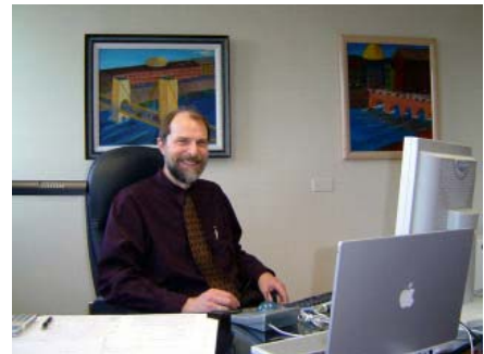
Joachim Messing

The investigators chose sorghum for study because it is a food staple in much of the world, including India and many countries in Africa. You can read more about the work here .