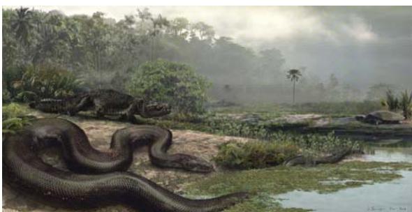
Artist's rendering of world's biggest snake. Credit: Jason Bourque, Florida Museum of Natural History