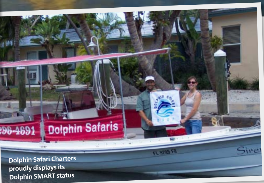
Dolphin Safari Charters proudly displays its Dolphin SMART status

The Florida Keys: heaven for dolphin watchers, and, if tours are managed properly, for dolphins too