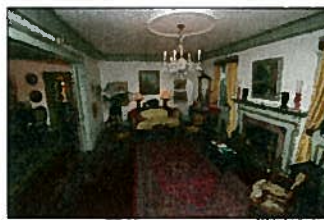
The drawing room and other interior areas at the Heritage House on Caroline Street are now available for formal and informal gatherings including weddings, retreats and community forums.

ON THE WEB: For more information, visit www.heritagehousemuseum.org .