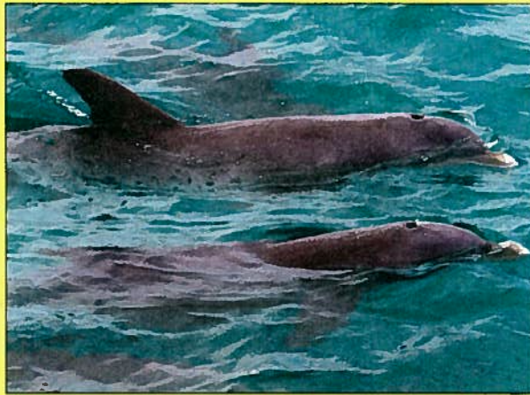
Dolphin watches are offered in the Keys and throughout Florida, but have sparked concern about harassment.