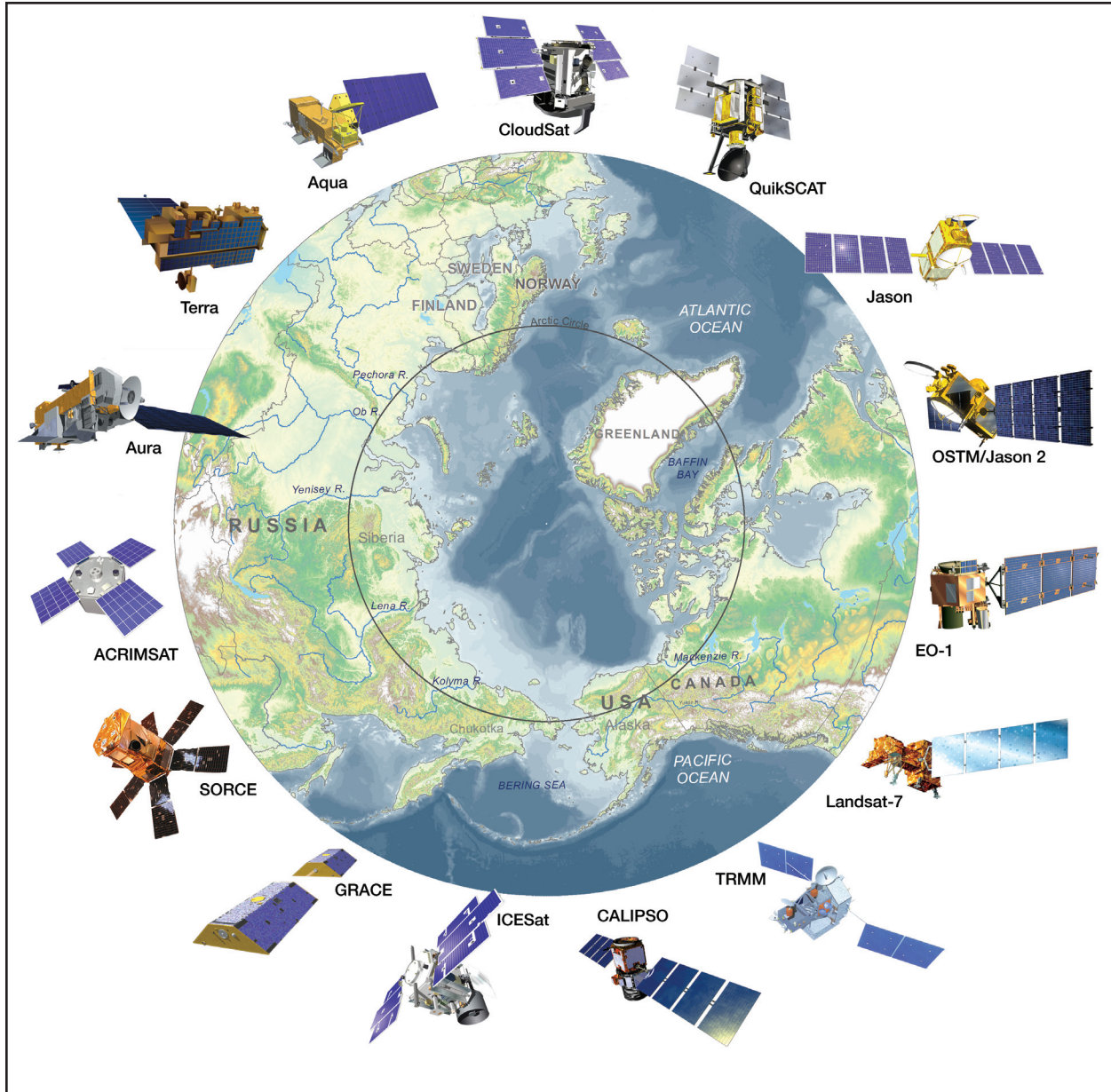
Figure 13. NASA constellation of operating satellites recording biological, chemical, physical and ecosystem measurements in the circum-Arctic with high fidelity space and time scales for studies of the changes in the circum-Arctic and for understanding the connectivity between the pan-Arctic region and the global integrated Earth system. Examples of measurements are stratosphere ozone (Ozone Monitoring Instrument/Aura), troposphere chemistry and composition (Tropospheric Emission Spectrometer/Aura), polar stratosphere clouds (Cloud-Aerosol Lidar and Infrared Pathfinder Satellite Observation or CALIPSO), troposphere aerosols (Multi-angle Imaging SpectroRadiometer/Terra), clouds (Cloudsat), ocean surface vector winds (QuikSCAT or Quick Scatterometer), sea ice temperature (MODIS or Moderate Resolution Imaging SpectroRadiometer/Aqua), sea surface temperature (Advanced Microwave Scanning Radiometer-E/Aqua and MODIS/Aqua), ocean color (MODIS/Aqua), total solar irradiance at the top of the atmosphere (Solar Radiation and Climate Experiment or SORCE), Greenland ice sheet mass (GRACE), Greenland ice sheet thinning (ICESat), rainfall (AMSR-E/Aqua), land imagery (Landsat-7), snow distribution on land (MODIS/Aqua), sea ice coverage (AMSR-E/Aqua), sea ice thickness (ICESat), and other variables.