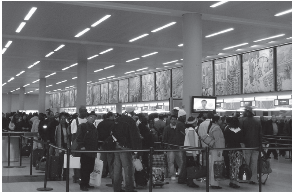
Figure 3: Arriving International Passengers Awaiting CBP Inspection at JFK International Airport