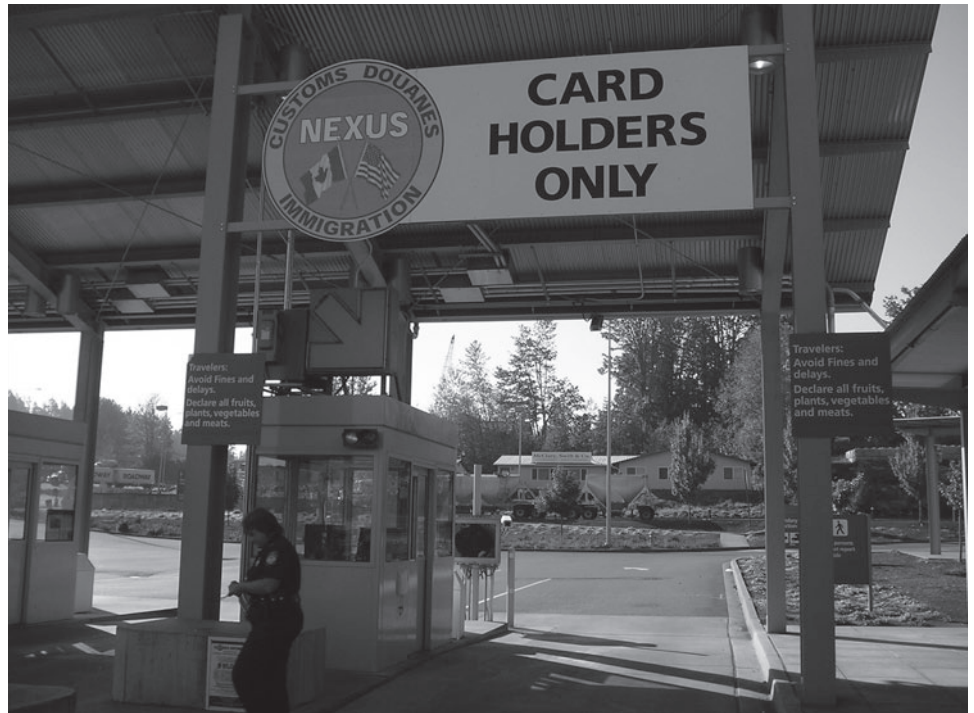
Figure 5: NEXUS Lane at a Port of Entry