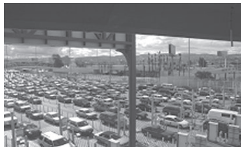
Vehicle Lanes at the San Ysidro Port of Entry