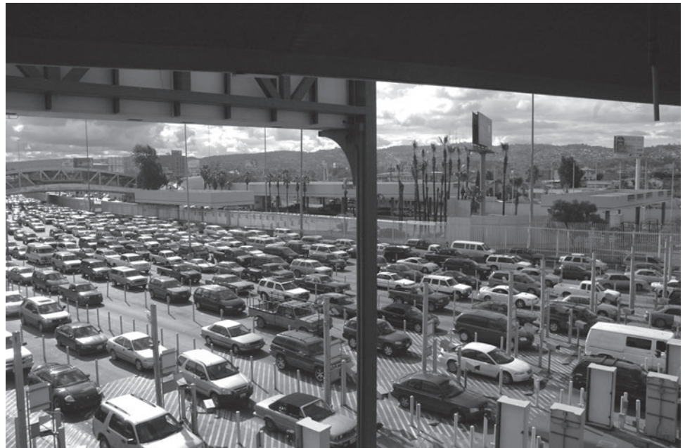
Figure 1: Vehicle Lanes at the San Ysidro Port of Entry

are at San Ysidro, Calexico, and Otay Mesa in California, and the Bridge of Americas in El Paso, Texas. In total, these four ports process about 27 percent of all travelers who enter the country by land.