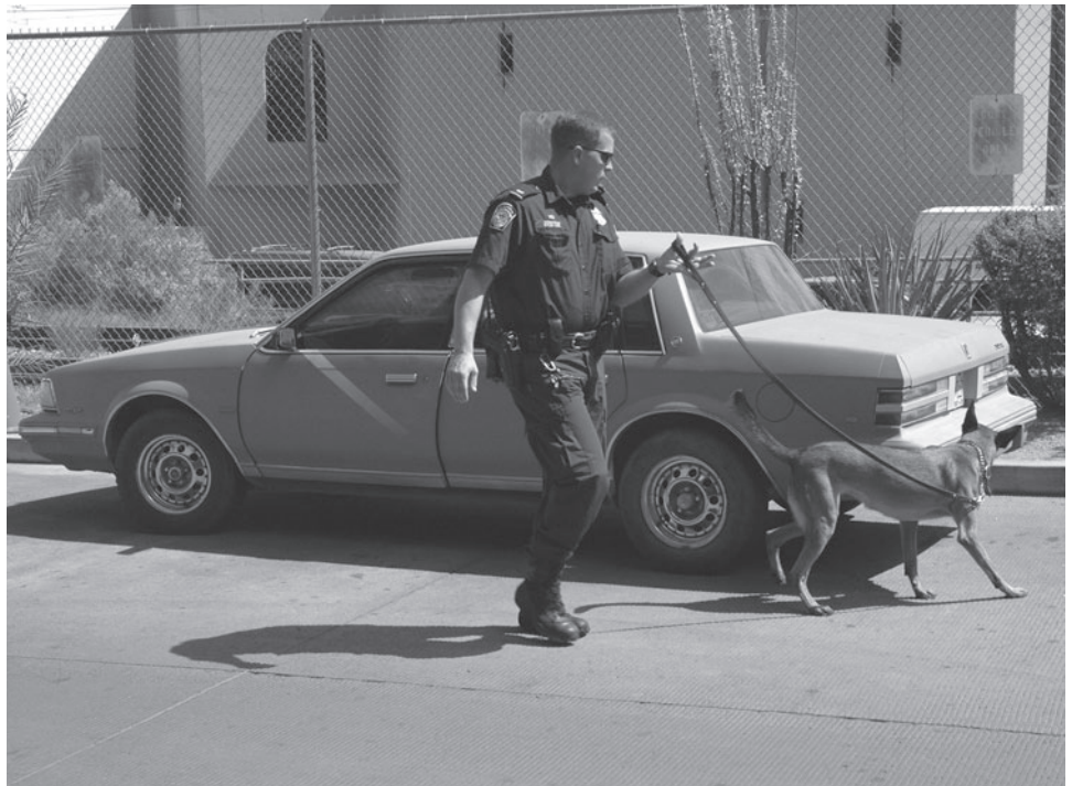
Figure 7: Canine Team Inspecting Vehicular Traffic at a Land Port of Entry