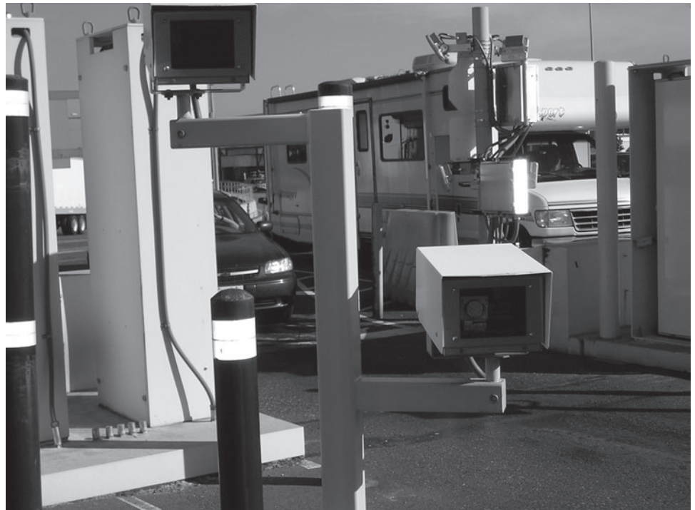
Figure 6: License Plate Reader at a Port of Entry