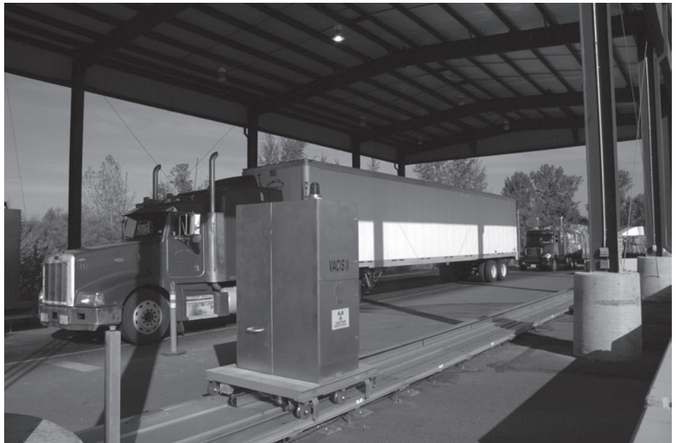
Figure 4: CBP Technology Used to Screen Commercial Trucks