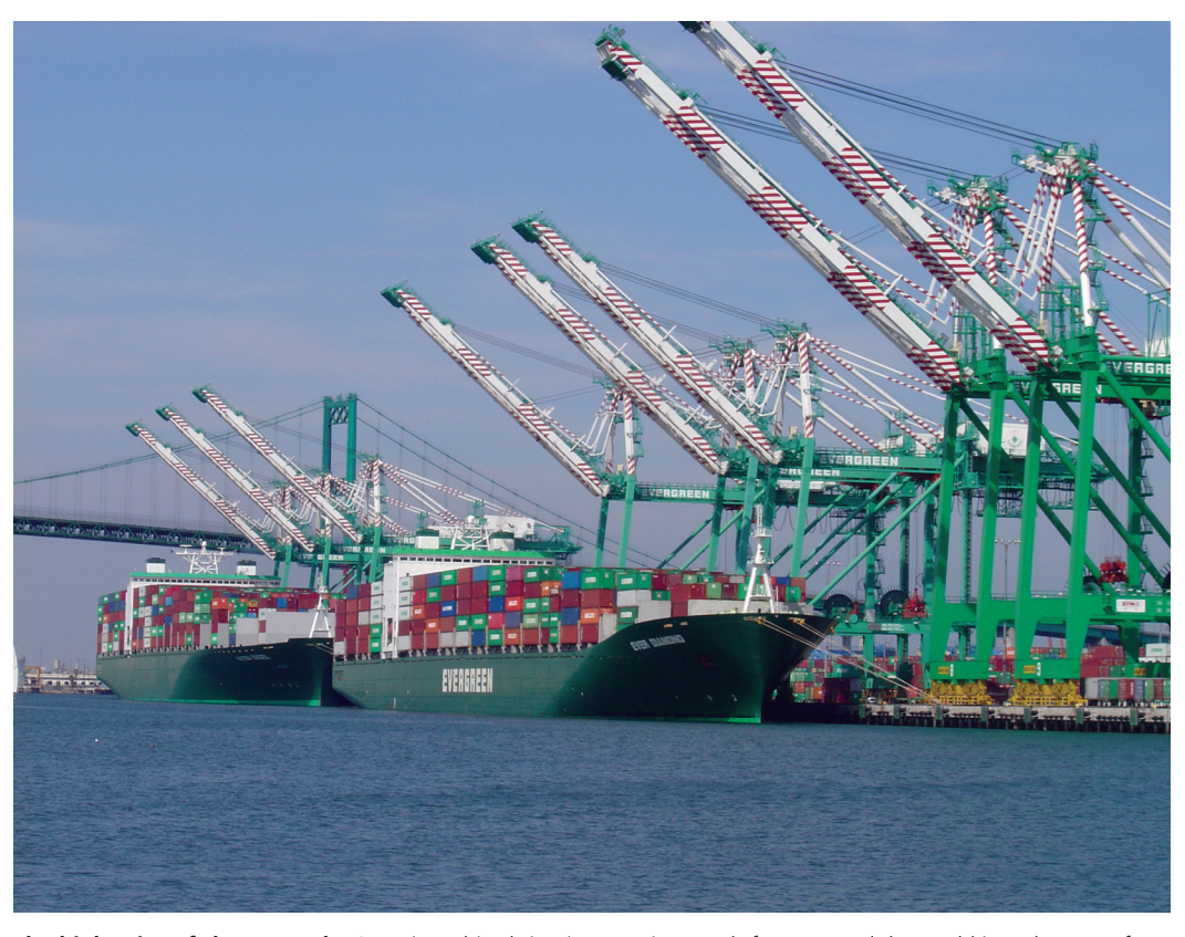
The SCEHSC, spurred by The high price of cheap goods. Container ships bring inexpensive goods from around the world into the Port of Los community concerns raised Angeles, but the pollution caused by transportation of these goods by ship, truck, and train has human health costs.