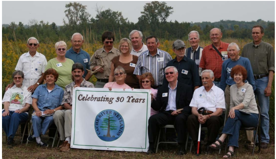
Early activists came together last September to celebrate 30 years of conservation action in the Cache.

Help us continue the celebration on Oct. 10 to recognize the many amazing efforts to protect the Cache as we honor landowners who helped make this project a success, specifically those landowners