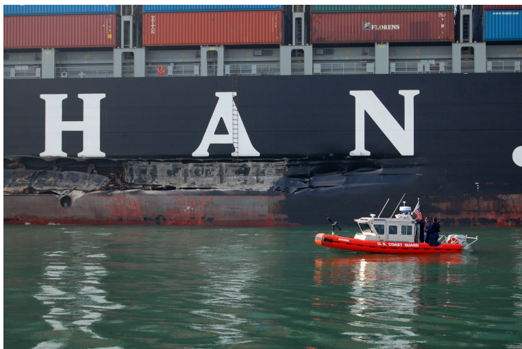
Damage to Cosco Busan.

technologies, emergency response protocols and data collection, and launching outreach and education campaigns.