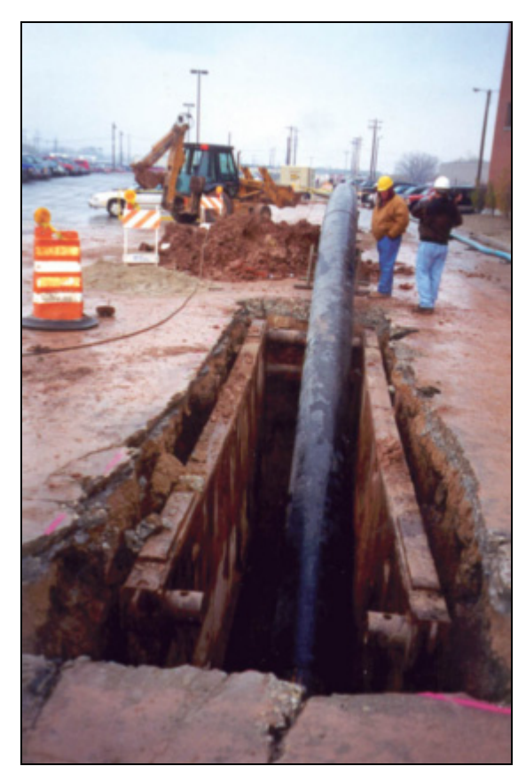
Figure 3. Pipe bursting to up-size pipe in Green Bay, Wisconsin.

existing pipe. Pneumatic heads pulse internal air pressure within the bursting tool, while hydraulic heads expand and contract.