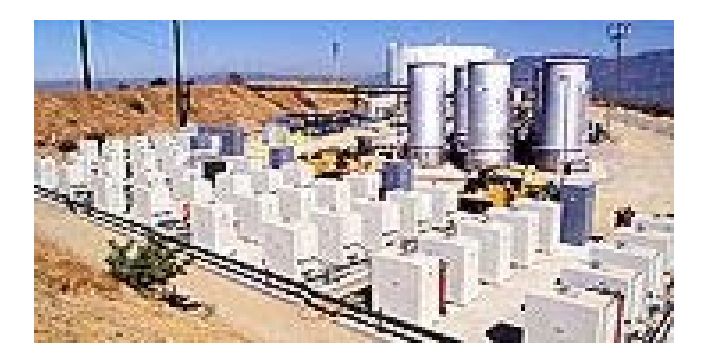
Large Scale Microturbine Application