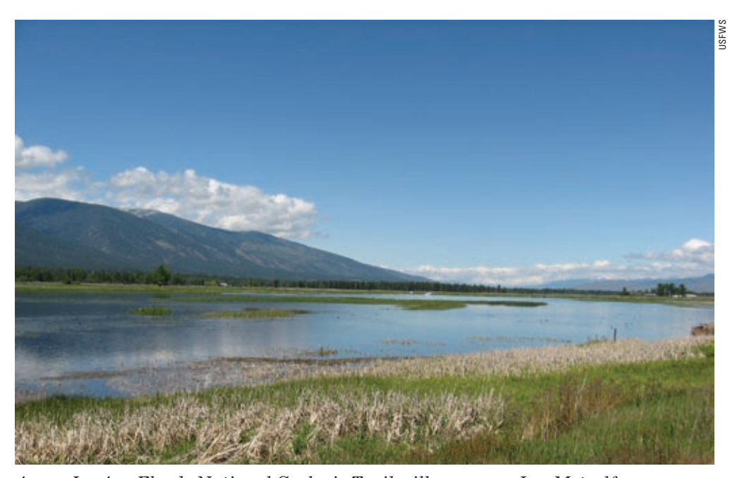
A new Ice Age Floods National Geologic Trail will pass near Lee Metcalf National Wildlife Refuge in Montana.