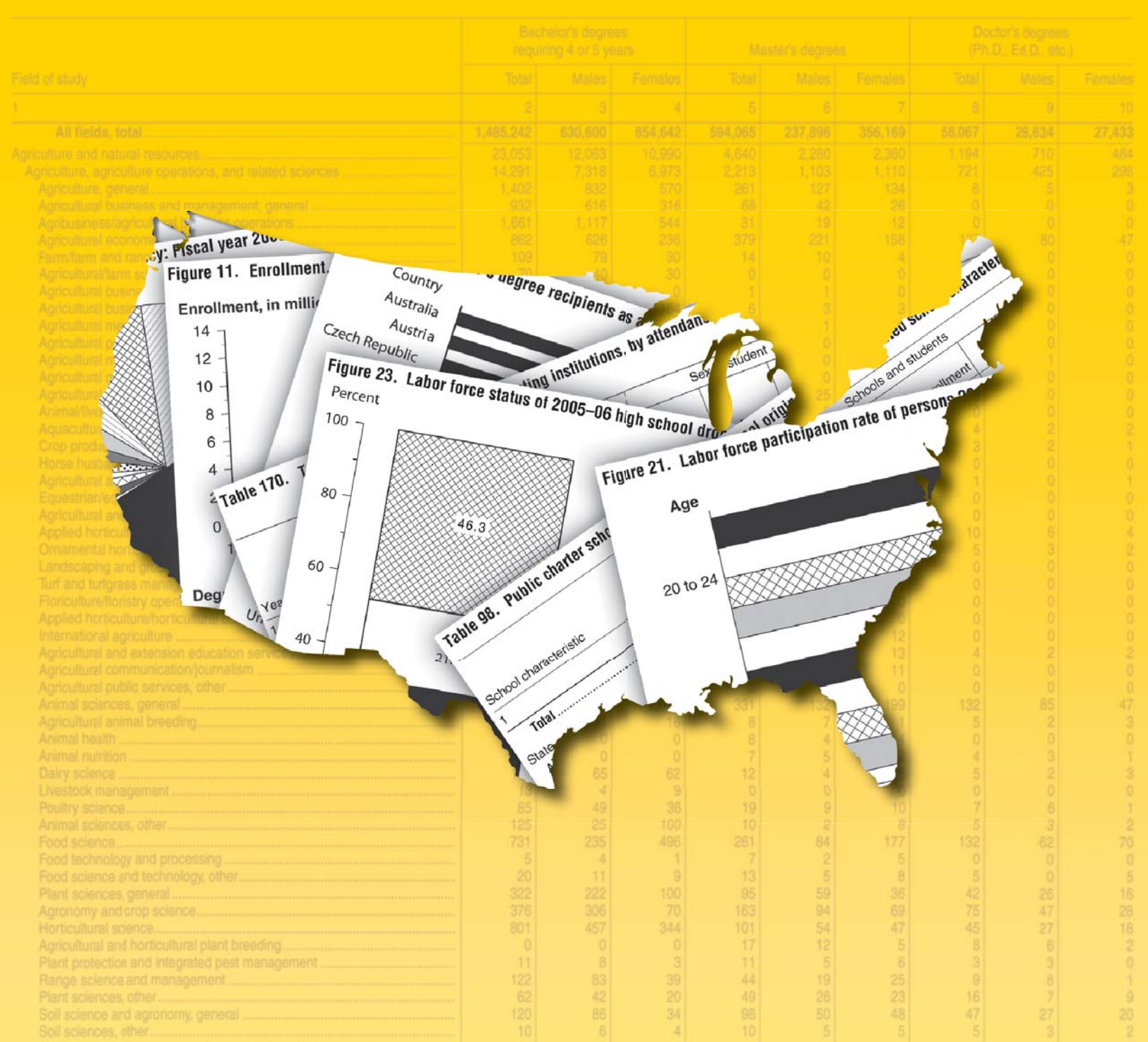
Table 265. Bachelor's, master's, and doctor's degrees conferred by degree-granting institutions, by sex of student and field of study: 2005–05

U.S. Department of Education Institute of Education Sciences NCES 2008-022