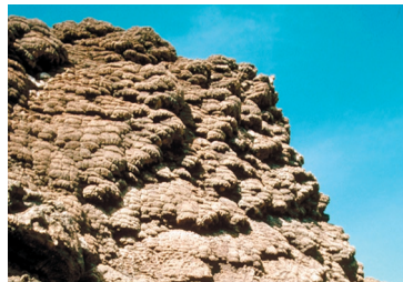
Figure 9. Tufa reefs coating Marble Bluff.