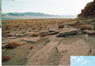
Figure 6. Layers of beachrock adjacent to and north of Indian Head Rock.

limited by lake level. In the Pyramid Lake subbasin, the elevations of the tops of many tufa mounds correspond to elevations of intersubbasin overflow points, or sills (fig. 2). When the level of Pyramid Lake was held constant by overflow to an adjacent subbasin, erosion of tufa and sediment occurred at and slightly above the overflow level, and deposition of tufa occurred below the overflow level. Terraces were created by both erosional and constructional processes. In addition, many other reef-like tufa deposits formed on rocky headland areas when the level of Pyramid Lake was kept relatively constant by overflow to adjacent lake subbasins.