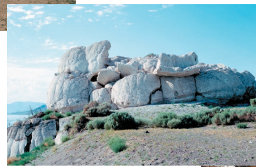
Figure 7. The southern Blanc Teton mound. Large tufa spheroids have been coated and cemented with white porous tufa.

bon method (Benson and others, 1995). The elevations and ages of the tufa allow us to construct a lake-level history for the last 35,000 years. The data indicate that Lake Lahontan rose sharply about 26,000 years ago and was maintained at about 1,265 m for the next 7,000 years by overflow to the Carson Desert. After a brief fall to less than 1,250 m, Lake Lahontan rose rapidly to its highstand (1,335 m) about 15,000 years ago and then fell rapidly between 14,000 and 13,000 years ago.