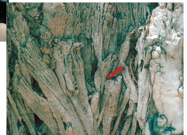
Figure 4. Thinolite crystals exposed at the base of the Blanc Tetons site.

or more layers of thinolitic crystals. In some situations, tufa forms combine to create tufa megaforms, such as tufa mounds (fig.7) and tufa reefs (figs. 8, 9). The largest collection of mounds occurs at the north end of Pyramid Lake at the Needles Rocks site. The locations of tufas depicted in this fact sheet are shown in Figure 10.