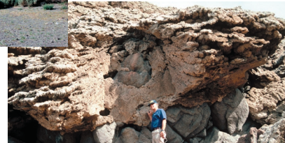
Figure 8. Tufa pillows making up a reef-like tufa on Anaho Island.

by removal of the lake sediment that surrounds them, may acquire additional calcium carbonate. The Needles Rocks area has experienced continued discharge of calcium-bearing waters into the bases of the tufa mounds. This younger calcium carbonate fills preexisting pore spaces in the tufa or adds calcium carbonate to the outside of a tufa. Many of the bases of tufa mounds that surround Pyramid Lake have been cemented with younger tufa, as indicated by the presence of “girdles” of calcium carbonate. Existing data indicate that the level of Pyramid Lake did not exceed the elevation of Mud Lake Sill which ranged from 1,177 to 1,183 m during the past 8,000 years (Benson and others, 2002), suggesting that cementation of the old tufa mounds occurred during that time interval.