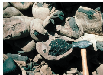
Figure 3. Dense tufa coating volcanic cobbles in the Terraced Hills area at the north end of Pyramid Lake.