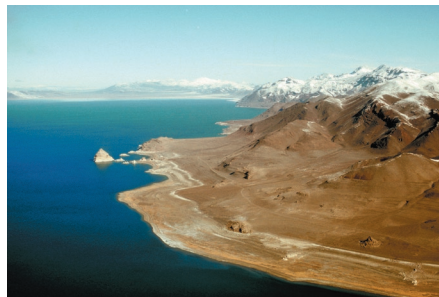
Figure 1. Pyramid Island along the east shore of Pyramid Lake.

The U.S. Geological Survey, in cooperation with the Pyramid Lake Paiute Tribe, has obtained radiocarbon ages of many of the tufa deposits that border Pyramid Lake in order to obtain a record