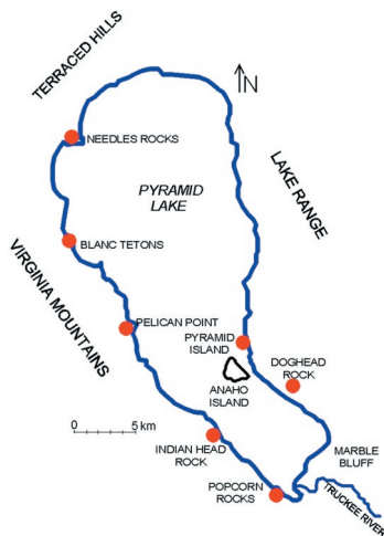
Figure 10. Locations of tufa sites discussed in this fact sheet.

Chief, Branch of Regional Research U.S. Geological Survey, MS 418 Denver Federal Center, Box 25046 Denver, CO 80225-0046