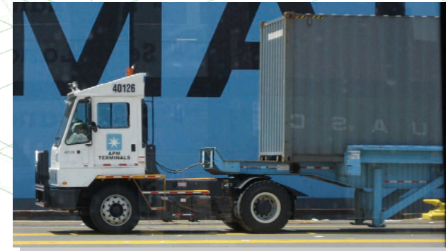
A typical yard hostler vehicle used to move containers at a sea port terminal.

The three key design features that contribute to improving the fuel efficiency of hydraulic hybrid vehicles are: