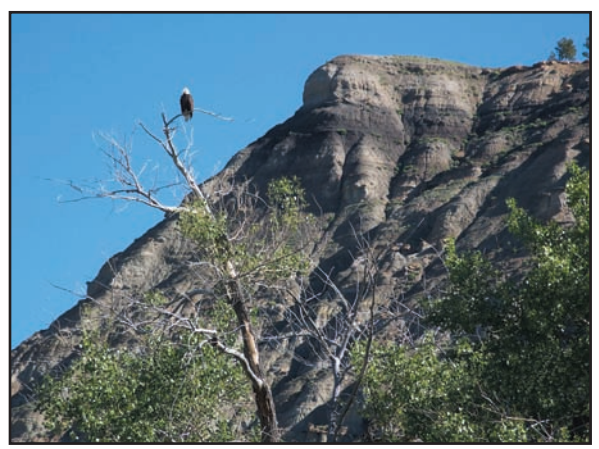
Bald Eagle at Grand Island

No action will be initiated on BLM land that will jeopardize any federally listed threatened and endangered plant or animal. Future actions will require site-specific environmental review and, if necessary, associated biological assessments. The BLM will comply with all decisions reached during consultation with the USFWS. Prior to the initiation of any action on BLM land, its effect on other sensitive species and state-designated species of special interest will be evaluated and applicable mitigation developed.