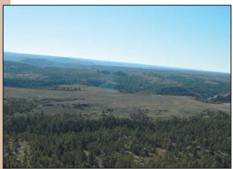
Black Butte North Airstrip

and Woodhawk. Five of the airstrips will be open yearlong while the Woodhawk airstrip will be restricted seasonally to provide wildlife habitat security during the fall hunting season (September 1 to November 30).