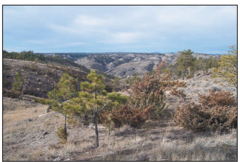
Missouri River Breaks

Visitor use data will be collected and analyzed with the results incorporated into future management decisions. Visitor use data includes hunter/client use days and areas of use. Social conflicts with the general public, as well as conflicts between or among outfitters will also be taken into consideration.