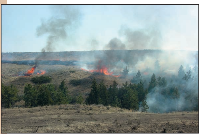
Armells Prescribed Fire

Appropriate management response based on current fire danger, resource availability and predicted weather will be used to ensure safety of fire suppression personnel, reduce cost of fire suppression and to return fire to a more natural ecological role. An appropriate management response may also include limiting fires ignited by lightning to pre-planned barriers and natural fuel breaks. Appropriate management response criteria will be based on risks to firefighters, public health and safety; land and resource management objectives; weather; fuel conditions; threats, values to be protected; and cost efficiencies.