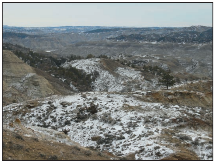
Ervin Ridge Bighorn Sheep Habitat

Seasonal or distance restrictions will be placed on oil and gas activities to protect sage-grouse nesting areas and winter habitat, active ferruginous hawk nests, big game winter range, and bighorn sheep distribution and bighorn sheep lambing areas.