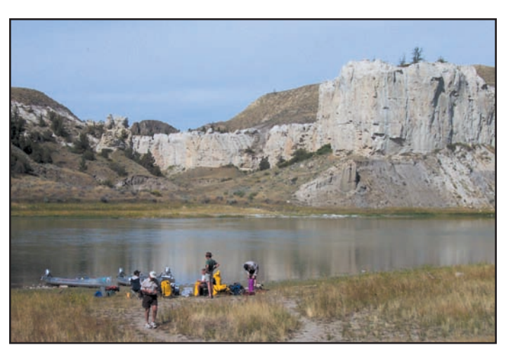
Campers at Eagle Creek