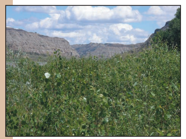
Riparian Area at McGarry Bar

The BLM will initially accomplish riparian-wetland objectives through livestock grazing methods at current stocking levels. If grazing methods are not successful in meeting management objectives, the BLM will take the necessary actions to achieve those objectives. To accomplish the riparian-wetland objectives, the BLM will consider the importance of the intermingled private lands, including valuable riparian-wetland areas that could be adversely impacted as a result of management changes on BLM land.