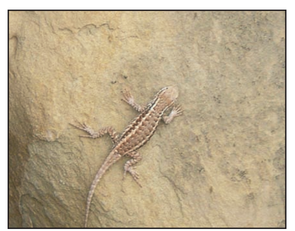
Sagebrush Lizard in the Antelope Creek WSA

peregrine falcon, prairie falcon, and golden eagle. Several pairs of bald eagles nest along the River in the monument and many others visit during the late fall and early winter. Shoreline areas provide habitat for great blue heron, pelican, and a wide variety of waterfowl. The River and its tributaries in the monument host forty-eight fish species, including goldeye, drum, sauger, walleye, northern pike, channel catfish, and small mouth buffalo. The monument has one of the six remaining paddlefish populations in the United States. The River also supports the blue sucker, shovel nose sturgeon, sicklefin, sturgeon chub, and the endangered pallid sturgeon. The Bullwacker area of the monument contains some of the wildest country on all the Great Plains, as well as important wildlife habitat. During the stress-inducing winter months, mule deer and elk move up to the area from the river, and antelope and sage grouse move down to the area from the benchlands. . . . "