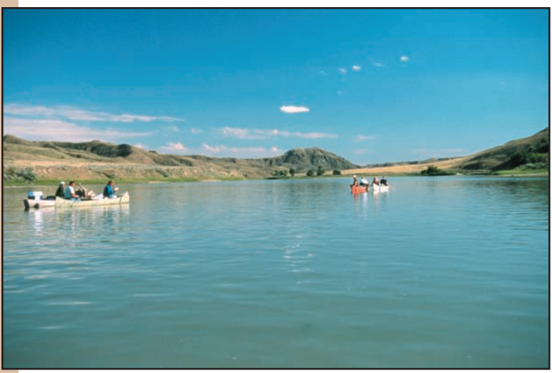
Floaters on the Upper Missouri River

Opportunities for Boaters – The BLM will not develop an allocation system for visitor use on the Missouri River. The BLM will monitor conditions and develop management actions, as necessary, to reduce impacts to resource and social conditions without limiting the number of people boating the Missouri River. Management actions may include, but will not be limited to, further restrictions on group size, limits on the number of nights allowed at one site, designated campsites, closure of campsites, construction of additional facilities, and development of additional dispersed campsites. Standards and Indicators (Appendix G) establish a broad framework for managing visitor use and impacts to resources and social conditions. As monitoring confirms change in visitor use patterns and