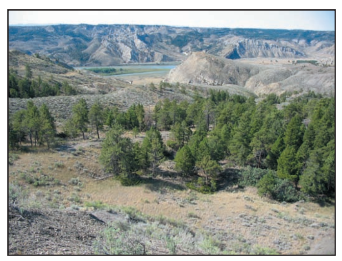
Antelope Creek WSA

review. Uses and/or facilities found to be impairing will be denied. The following criteria are referred to as the nonimpairment criteria.