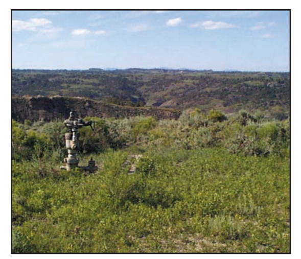
Shut-in Well on Ervin Ridge

heavy trucks related to production, equipment that exceeds 49dB will be restricted from being within 2 miles of sage-grouse leks between 4:00 a.m. and 8:00 a.m. and from 7:00 p.m. to 10:00 p.m. between March 1 and June 15.