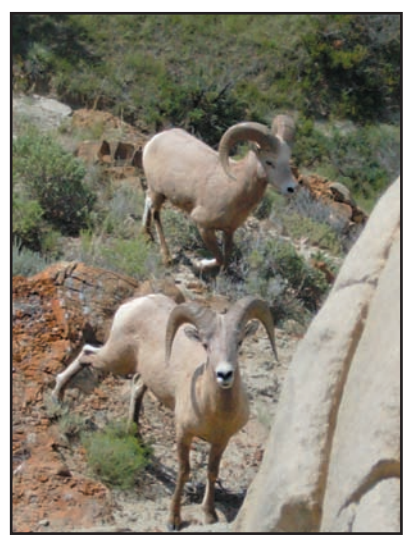
Young Bighorn Rams