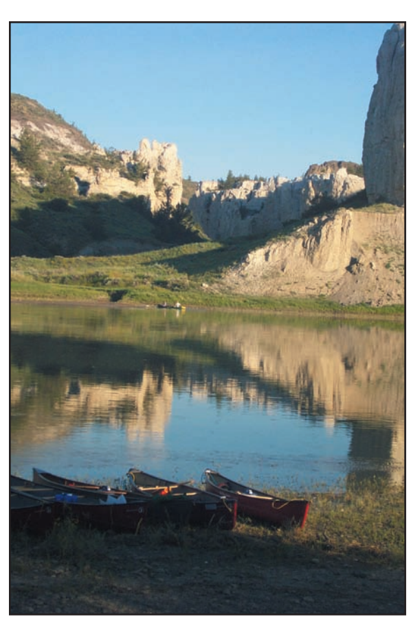
Upper Missouri National Wild and Scenic River

The BLM will coordinate with the USFWS on bankside recreation use and management within the Charles M. Russell (CMR) National Wildlife Refuge boundaries, between river miles 139-149.