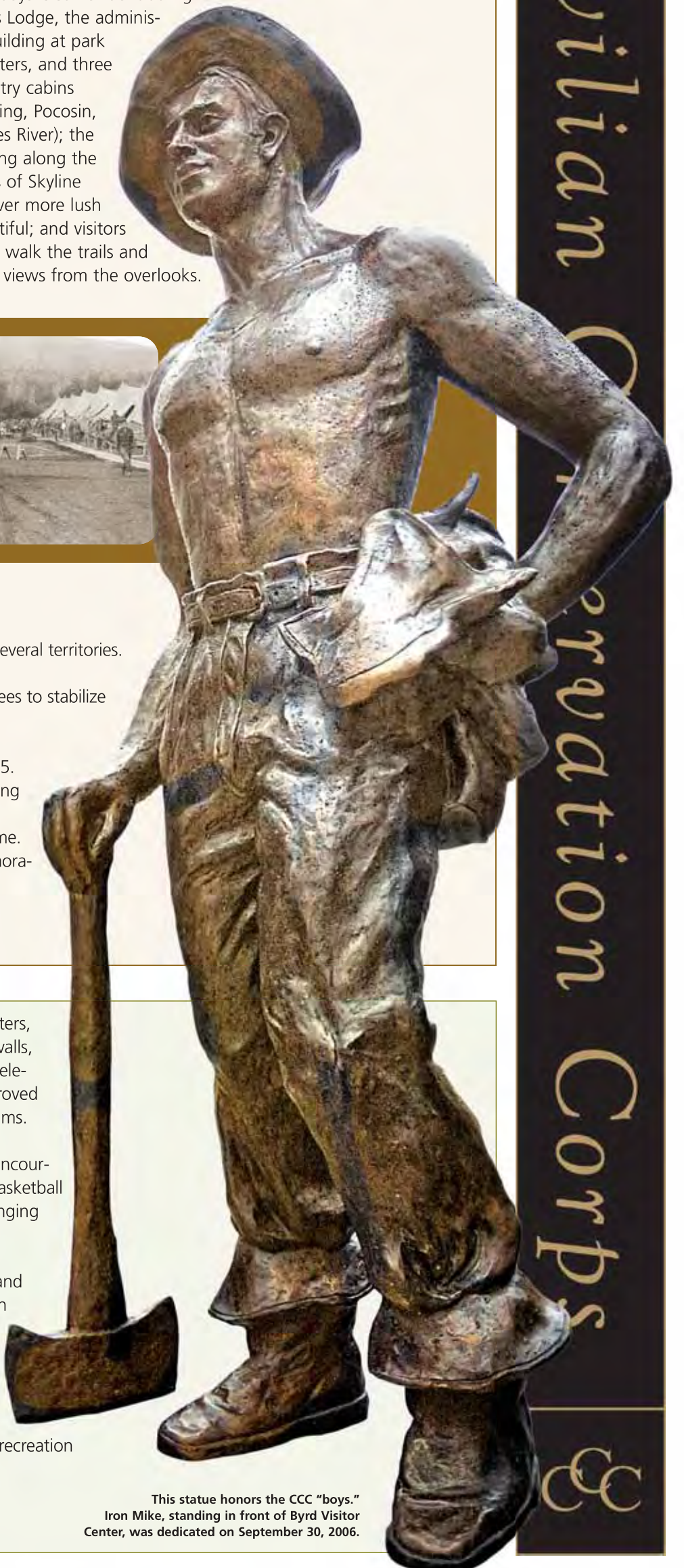
This statue honors the CCC "boys." Iron Mike, standing in front of Byrd Visitor Center, was dedicated on September 30, 2006.

Today, 75 years after it began, the CCC's legacy of hope, pride, and conservation is still visible in public recreation areas across the nation.