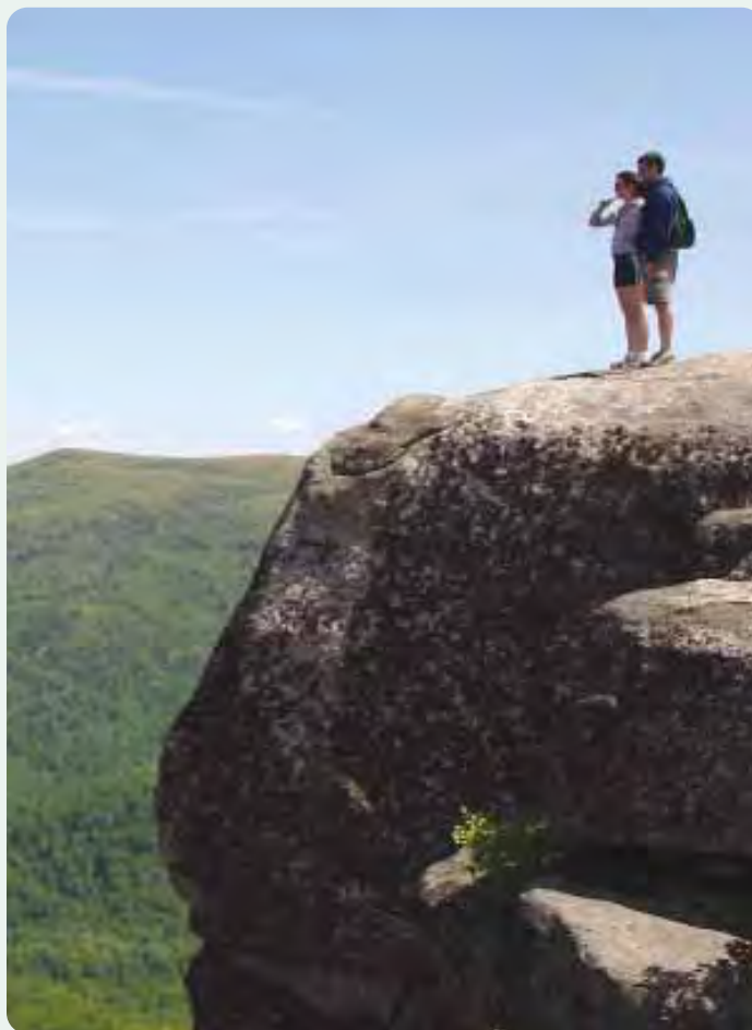
From overlooks along Skyline Drive and from peaks and high places along trails, you'll be on the edge looking out and far beyond—perhaps over one of Shenandoah National Park's designated wilderness areas.

So get connected while you're here and stay connected via our website ( www.nps.gov/shen ). These are exciting times in your national park. We invite you to get involved—volunteer with a group to combat invasive plant species, support Shenandoah as a member of the Shenandoah National Park Association, tell your friends about the beauty of this park in all seasons—and come again as often as you can!