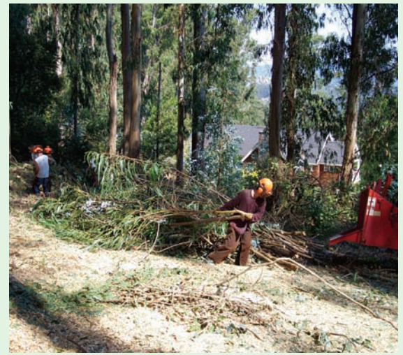
Above: Eucalyptus branches are hauled to a chipper during a fuel reduction project.