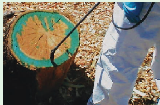
East Bay Regional Parks