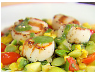
Recipe courtesy Ellie Krieger