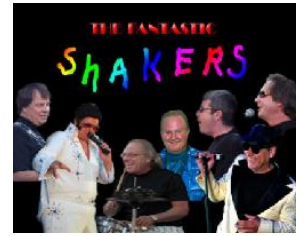
The Fantastic Shakers

The National Advocacy Center provides free shuttles to the Vista Monday-Thursday starting at 5:30 PM and runs every 1/2 hour with the last shuttle leaving at 10:37 PM.