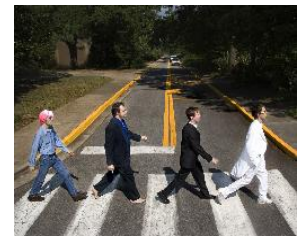
Abbey Road Live

1/4 cup chopped fresh basil leaves If using ears of corn, cut the kernels off and set aside. Discard the cobs. Heat the oil in a large skillet over medium heat. Add the onions and cook, stirring occasionally, until softened, about 2 minutes. Add the garlic and cook for 1 minute more. Stir in the corn, lima beans, zucchini, and tomatoes and cook, stirring occasionally, until the vegetables are tender, about 7 minutes. Spray a large nonstick skillet or grill pan with cooking spray, and preheat it over medium-high heat. In the meantime, prepare the scallops. Pat them dry and season them with 1/4 teaspoon of salt and 1/4 tea- spoon of pepper. Add the scallops and cook until the inside is opaque, 5 to 6 minutes, turning once. Stir the vinegar and basil into the succotash, season with additional salt and pepper, to taste, and serve topped with grilled scallops. Garnish with Parsley Drizzle.