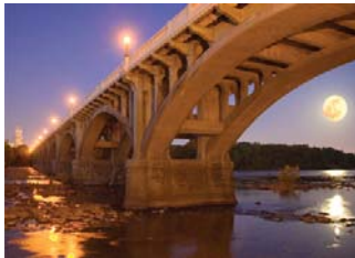
Gervais Street Bridge in the Vista

1 cup lightly packed flat-leaf parsley leaves 2 tablespoons extra-virgin olive oil 1 tablespoon fresh lemon juice 2 tablespoons water, as needed to slacken Combine all ingredients in a blender and puree. Yield: 1/2 cup