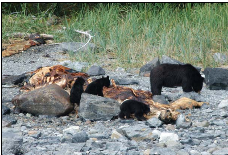
Figure 5. Black bear sow with three cubs feeding on the carcass of #1432's calf on Strawberry Island, August 30, 2004.

Outside the study area, we received a report in mid-May of a humpback whale entangled in fishing gear near Point Couverden. In mid-August a humpback whale calf was found floating dead near Juneau. A detailed necropsy revealed that the whale was a nursing female calf with a severely fractured scapula (Tuomi 2004).