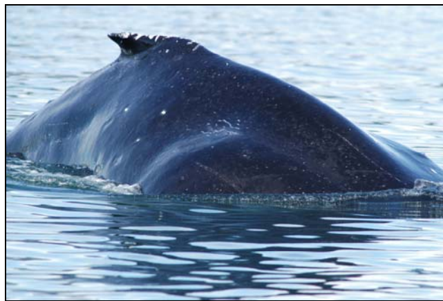
Figure 6. Whale #1809 with bulge of ribcage evident.

Whale #1809 is a small whale of unknown age that has appeared unhealthy since it was first documented in the study area on July 10, 2003. This whale's dorsal fin leans to the right, its rib cage is visible (Fig. 6) and color photographs reveal that it is carrying an unusually high concentration of whale lice (cyamids). In May 2004 we collected a sloughed skin sample with a live cyamid attached after whale #1809 breached. This whale also has scars around its caudal peduncle that clearly indicate it has been entangled (Doherty et al. in press).