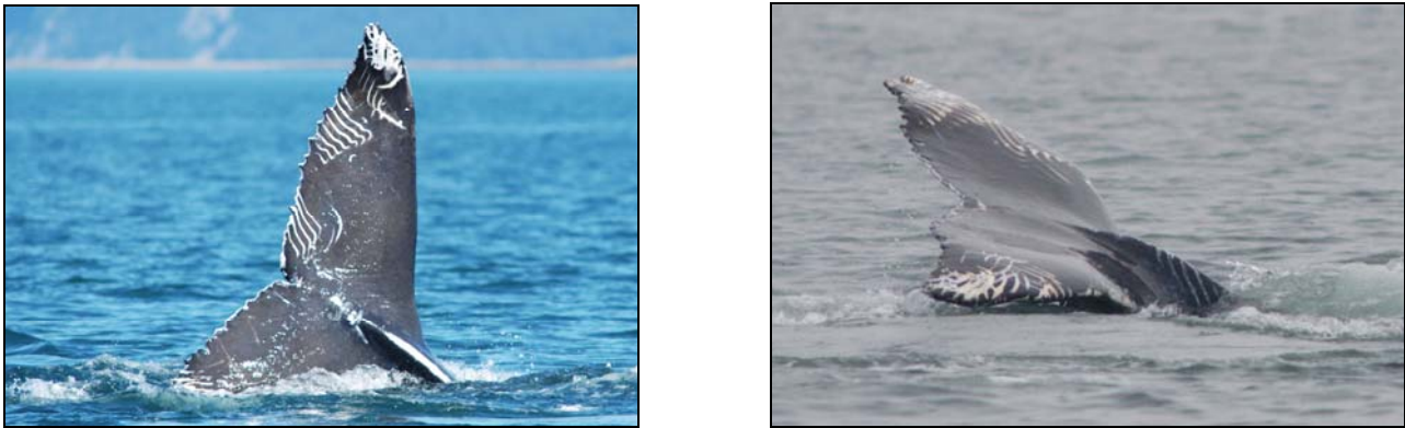
Figure 3. Whale #944's calf with extensive scarring from killer whales.

We observed whale #944's calf (#1846) several times this summer with extensive, healed killer whale rake marks all over its caudal peduncle and flukes (Fig. 3). Otherwise the calf appeared to be healthy and active. We do not know if the killer whale attack occurred in the study area.