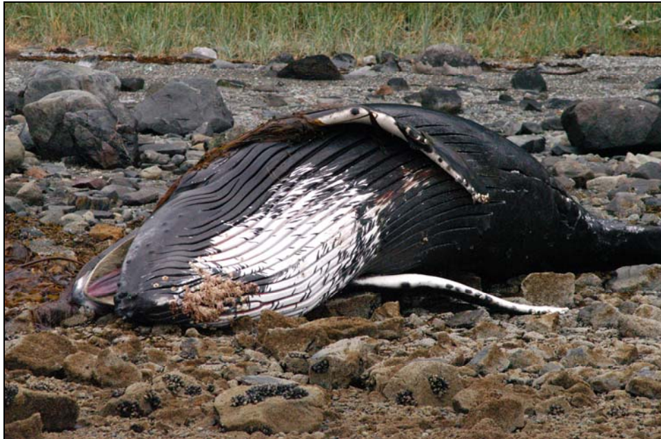
Figure 4. Dead humpback whale calf found on Strawberry Island, July 30, 2004.

side of its body (Gulland and Tuomi 2004). Based on post-mortem dorsal fin photographs we identified the whale as the calf of whale #1432. Although it is possible that the calf was struck by something other than a vessel (for example a killer whale or another humpback whale), it seems more likely that it was hit by a vessel. We hypothesize that the collision took place sometime on July 29 within a few miles of where the whale was found. A 13 knot vessel speed limit was in place in lower bay whale waters at the