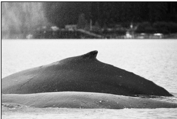
Figure 3. Whale #221’s dorsal fin prior to damage.

Whale/Human Interactions: There were two incidents in Glacier Bay in which a humpback whale surfaced in very close proximity to a transiting cruise ship’s bow, but neither close call resulted in a collision. In early July the operator of a 6.7 m Zodiac struck a single humpback whale in Icy Strait but the whale and the vessel operator survived. We documented a healed injury to whale #221’s dorsal fin that had occurred since our last sighting of this whale on September 5, 2002 (Figs. 3, 4). This resembled injuries that we documented in 2001 to whale #166’s dorsal fin and in 2002 to whale #118’s dorsal fin (Doherty and Gabriele 2001). Unfortunately, we can not determine the origin of these injuries.