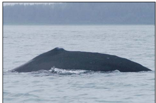
Figure 4. Whale #221’s dorsal fin, summer 2003.

Over the course of the summer we documented five incidents in which whales were harassed by aircraft circling or hovering at low altitude; one incident involved a commercial air taxi and four incidents involved U.S. Coast Guard helicopters. In early July USGS biologists reported a possible entangled