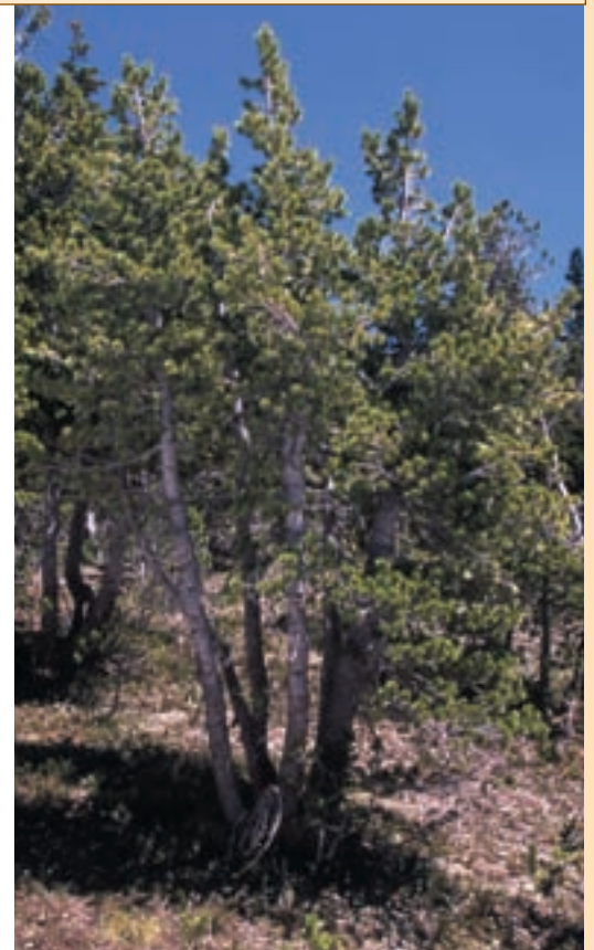
These whitebark pines grow in the andesitic soils on Mount Washburn.