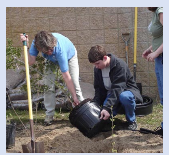
Junior Friends group supports both Pea Island and Alligator River Refuges.

With Dreis and fellow teacher Amy Redford as co-sponsors, the club's 20 students meet six times during the school year, and go on at least two Saturday field trips. At meetings, the Junior Friends learn about birds in the neighborhood and on the refuges, bears and red wolves of eastern North Carolina, wildlife tracking and identification methods, and sea turtles. The students regularly maintain the grass garden at Pea Island Refuge, and work with rangers and the Friends of the Alligator River Wildlife Refuge on various projects. The Junior Friends are also involved in wildlife projects at school, including creating a wildlife habitat garden on the campus.