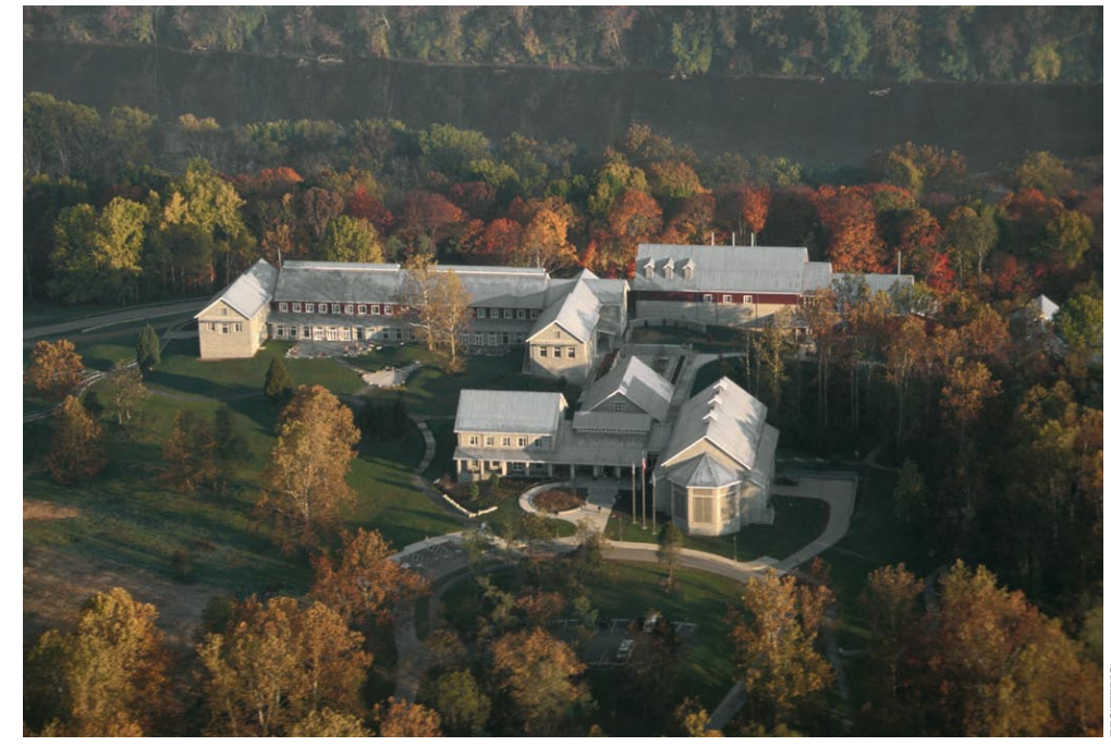
The National Conservation Training Center will be the site of the first Friends Academy.

The concept of a Friends Academy won special support in the wake of regional Friends workshops that brought together hundreds of Refuge Friends to explore how to plan projects over several years, using the Refuge System's 12 strategic goals. During the regional workshops, many individuals continued on page 8