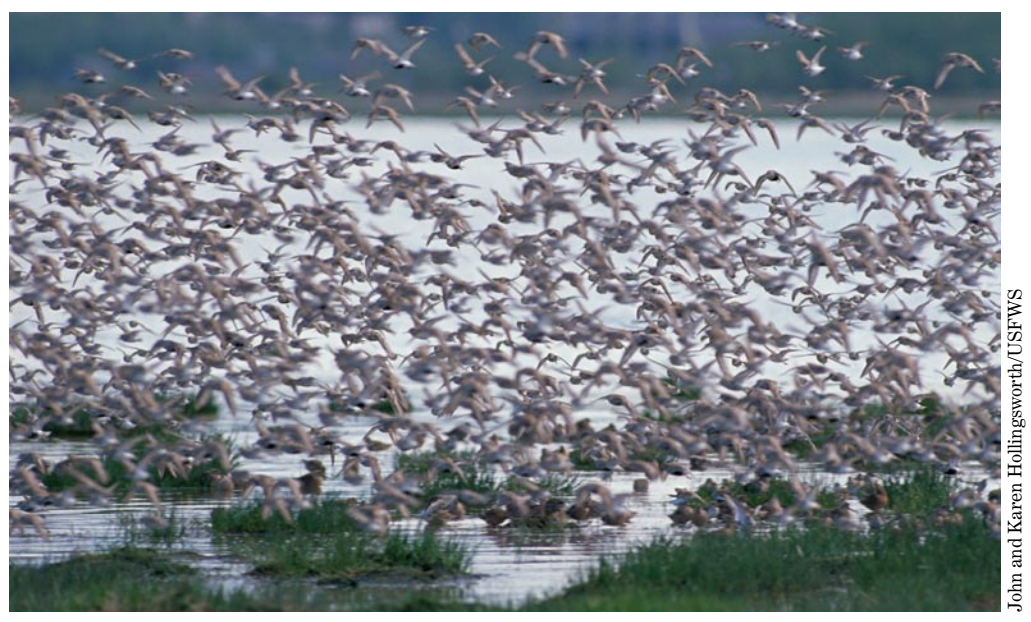
The Congressional Wildlife Refuge Caucus is seeking to support adequate budgets for the Refuge System and create a voice for refuges in Congress. So far, at least 120 House members have joined.

One of the caucus's first acts was to introduce the Refuge Ecology Protection, Assistance, and Immediate Response (REPAIR) Act, which promotes greater cooperation among federal, state and private interests to control non-native species. REPAIR would make permanent the Cooperative Voluntary Invasive Species Monitoring and Control Program, which has for the past three years enabled hundreds of Friends to detect invading plants and