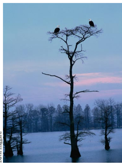
The Beyond the Boundaries workshop will include a series of focused presentations on such issues as water quantity and quality, the nation's changing demographics, and how local land use decisions affect national wildlife refuges.

The Beyond the Boundaries workshop, scheduled for March 2-5 in Washington, DC, will bring together 75-80 participants, including refuge managers and members of 30 Friends organizations, to expand the ability of citizen conservationists to meet the growing conservation challenges of the 21st century. The workshop is