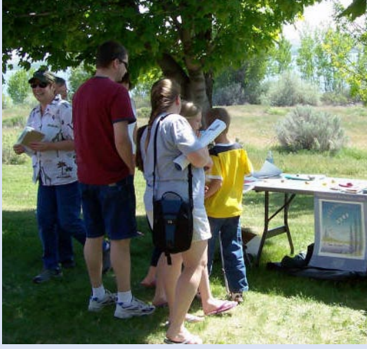
Friends of Deer Flat National Wildlife Refuge formed committees immediately.

The group quickly created a Web site, and started publishing a bimonthly newsletter. Members initially looked for