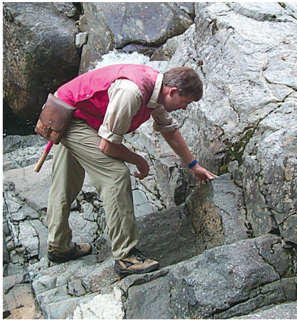
Fractures form complex paths for fluid movement in fractured-rock aquifers. Mapping rock types and fractures, where the rock is exposed, enables scientists to link fracture orientation, the interconnectivity of fractures, and fracture length with the availability of water.

ing population growth in the Northeast, Southeast, and mountainous regions of the West are likely to rely heavily on water supplies from fractured-rock aquifers.