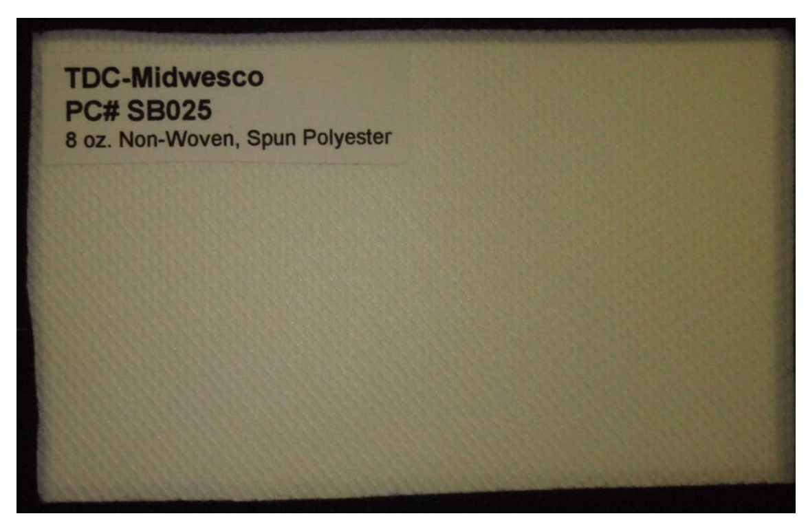
Figure 1. Photograph of TDC Filter Manufacturing, Inc.'s SB025 Filtration Media