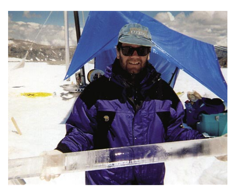
Total mercury in 97 ice-core samples was determined with trace-metal clean handling methods and low-level analytical procedures.

To gain a better understanding of the long-term history of mercury input and the relative contributions of different sources, U.S. Geological Survey (USGS) scientists analyzed the historical patterns of atmospheric mercury deposition preserved in icecore samples. Ice cores are valuable tools for reconstructing paleoclimatic and paleoenvironmental records, but cores have not been commonly retrieved from the low and mid-latitude regions of the Earth. The ice cores analyzed in this study were collected from the Upper Fremont Glacier (UFG) in the Wind River mountain range of Wyoming. As a result, the USGS effort to identify the record of atmospheric mercury deposition preserved in these cores is the first of its kind in North America. Atmospheric mercury concentrations in these cores are not likely influenced by local anthropogenic sources. Total mercury in the 97 icecore samples was determined using trace-metal clean handling methods and low-level analytical procedures.