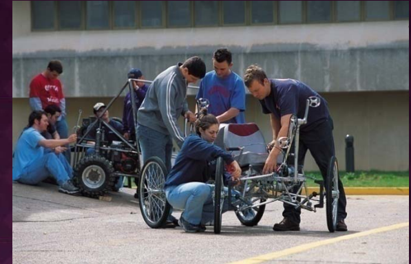
UE Team Wins NASA Moon Buggy Competition