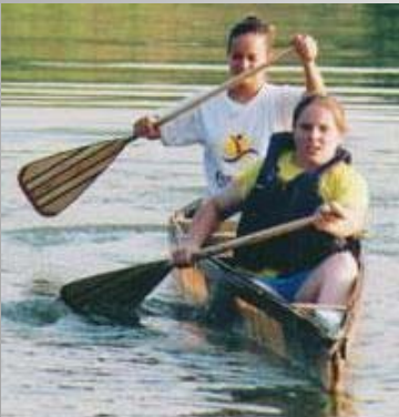
ASCE Concrete Canoe Competition