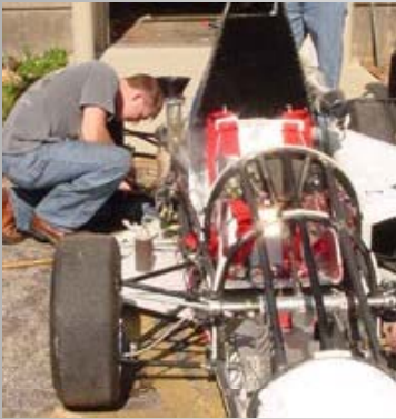
Formula SAE Competition