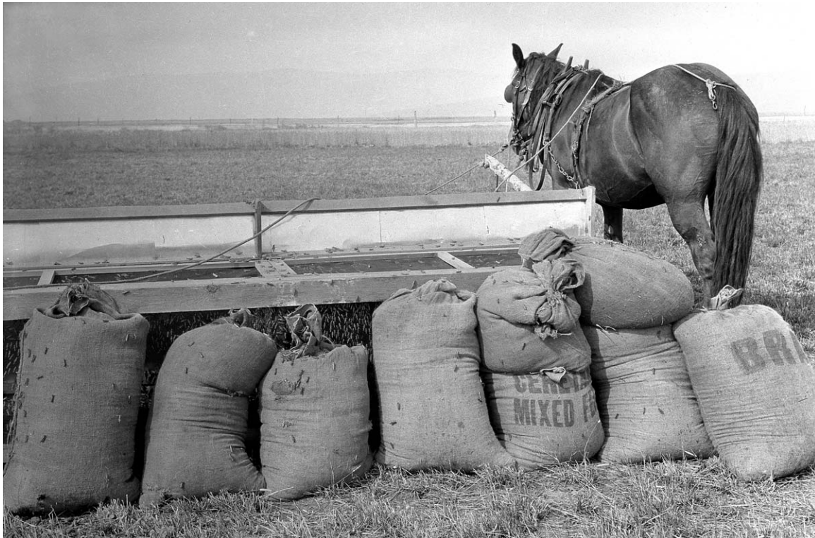
Figure 1. This horse-powered grasshopper-catching machine, in use near St. Ignatius, Montana, in 1917, illustrates an early nonchemical technique for grasshopper control. In 2 hours and 15 minutes, approximately 363 kilograms of grasshoppers were caught with this machine, bagged, and dried for use as winter poultry food. Numerous designs for grasshopper-catching machines, or “hopper dozers,” were developed beginning in the 1870s. Although their effectiveness as a control technique was debated, grasshopper-catching machines were advocated as a means of reducing grasshopper populations in infested fields and providing poultry feed, while avoiding risks to livestock from the use of highly poisonous, arsenic-based baits.

Hewitt and Onsager (1983), for example, estimated economic losses to grasshopper herbivory based on 16 years of data on grasshopper densities, compiled from across the western United States over a period that included both outbreak and nonoutbreak periods. By their calculations, grasshoppers regularly cause the loss of roughly $1.25 billion per year (converted to 2005 dollars) in forage that could potentially be fed on by livestock.