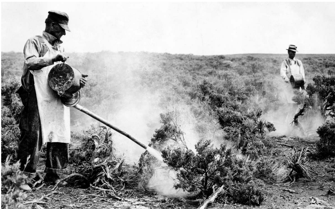
Figure 3. Workers spreading sodium arsenite dust for Mormon cricket control in Sheridan County, Wyoming, in 1935. Nonspecific and highly toxic arsenic-based compounds were the principal toxin used in grasshopper and Mormon cricket control programs from 1885 until the 1940s, when newer, more potent insecticides such as sodium fluosilicate and chlorinated hydrocarbons became widely available. After problems were discovered with the persistence and bioaccumulation of DDT in the 1960s, the organophosphate compound malathion became the most common insecticide used for grasshopper control; it is still used, along with the carbamate carbaryl, for grasshopper control programs in the United States. Over the last few years, Dimilin (diflubenzuron), which functions as a chitin inhibitor and prevents successful molting of insects, has seen increasing use in grasshopper control programs in the western United States because it has fewer nontarget effects on terrestrial insects and vertebrates.

It is time to incorporate significant advances in researchers' understanding of insect population dynamics into grasshopper control. A variety of nonlinear population responses that are important for understanding grasshopper population dynamics, including feedbacks and thresholds, have been discovered in population models. These complex population responses arise from dynamic density-dependent and frequency-dependent food web interactions (Schmitz 1998, Danner and Joern 2004) and predict a range of indirect feedback relationships that can greatly modify direct responses. Density dependence results from limited resource (e.g., food) availability within a trophic level, or from interactions with natural enemies between trophic levels, and these interactions limit grasshopper populations. Chemical control necessarily disrupts or otherwise affects these relationships in unpredictable ways. In the simplest case, other arthropods besides the target may also be killed, freeing up resources or reduc-