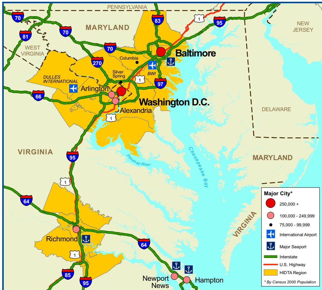
Figure 2. Washington/Baltimore HIDTA region transportation infrastructure.