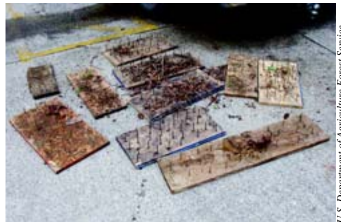
Figure 2. Punji stick boards seized from cannabis cultivation operations in Kentucky, 2006.

Cannabis cultivators frequently use camouflage, countersurveillance techniques, and booby traps to protect their outdoor grow sites. Law enforcement officials in Kentucky report that cannabis cultivators commonly camouflage marijuana crops by